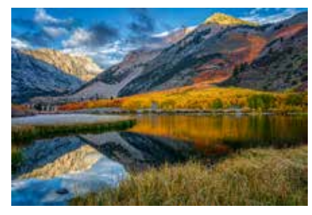
"Morning in the Eastern Sierras" by Rose Epps