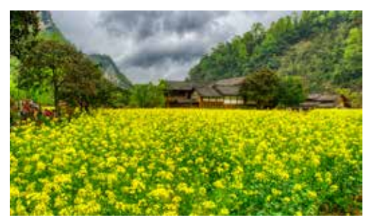
Rapeseed Flowering Fields, Hunan China Matti Jaffe