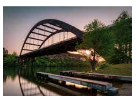
Bridge at Dawn Rose Epps