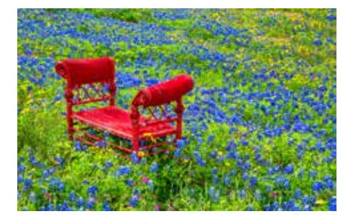
Angel's Bench Beverly Lyle