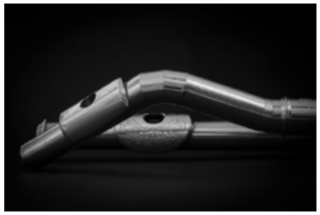
A Flutist's Fantasy Danelle Sasser