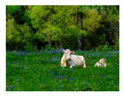
Chewing the Cud in the Bluebonnets Beverly Lyle