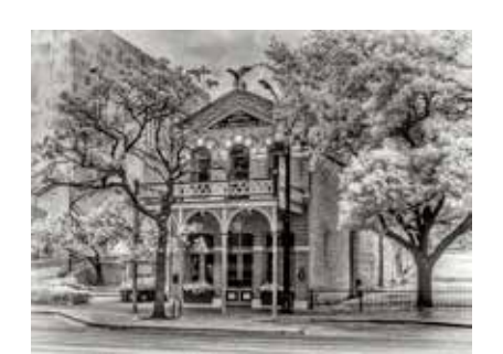
Old Bakery and Emporium Pete Holland