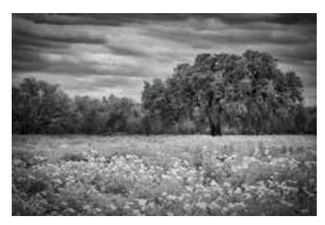
Big Live Oak & Poppies Kathy McCall