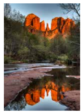
Sunset at Cathedral Rock Haytham Samarchi