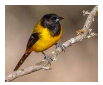
Black Vented Oriole Joyce Bennett