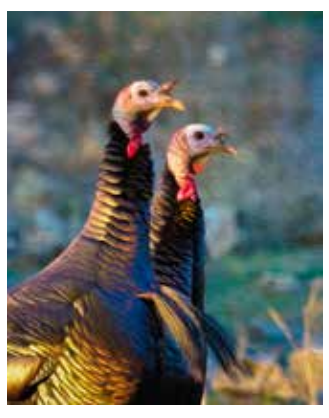
"Double Trouble Turkeys" by Steve Houston

Images with unlimited use of imagination, filtration, derivations, computer manipulation, composites or other computer crafted techniques. Image must be based on an original photographic capture by the exhibitor.