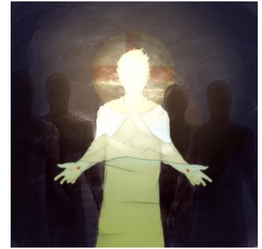
Figure 1: image from fullofeyes.com

"...make disciples of all nations, baptizing them in the name of the Father and of the Son and of the Holy Spirit, teaching them to observe all that I have commanded you. And behold, I am with you always, to the end of the age" (Matthew 28:19-20).