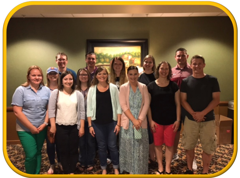
NSBEA New Teachers