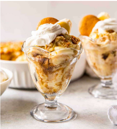
Banana Pudding Sundae