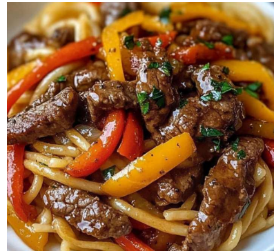
Classic Pepper Steak Pasta