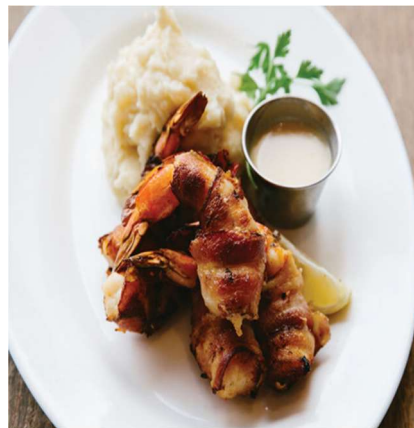
Bacon Wrapped Shrimp