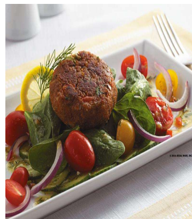
Salmon Cake Salad