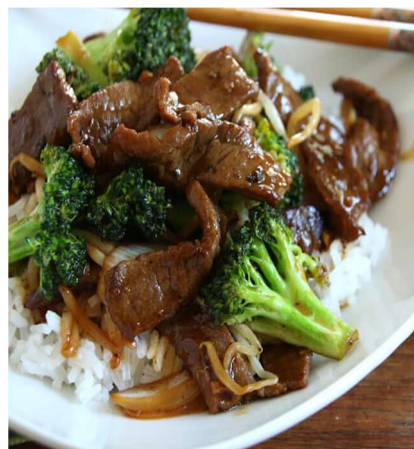
Saucy Beef & Broccoli