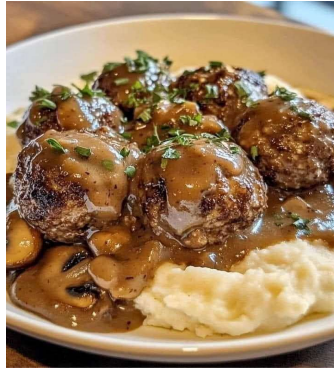
Salisbury Steak Meatballs