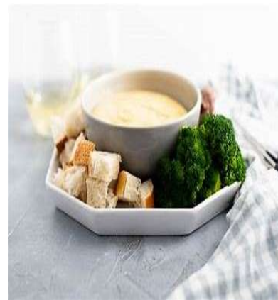
Three Cheese Fondue Plate