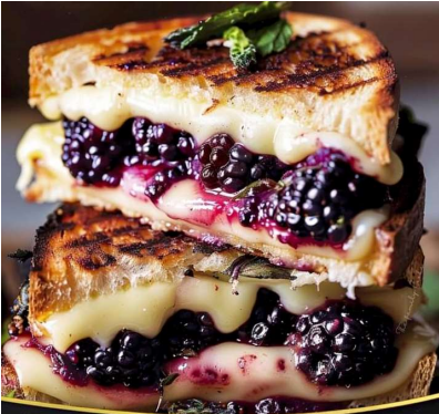
Blackberry Grilled Cheese