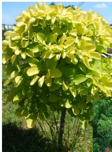
Yellow smoke tree