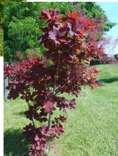
Red smoke tree