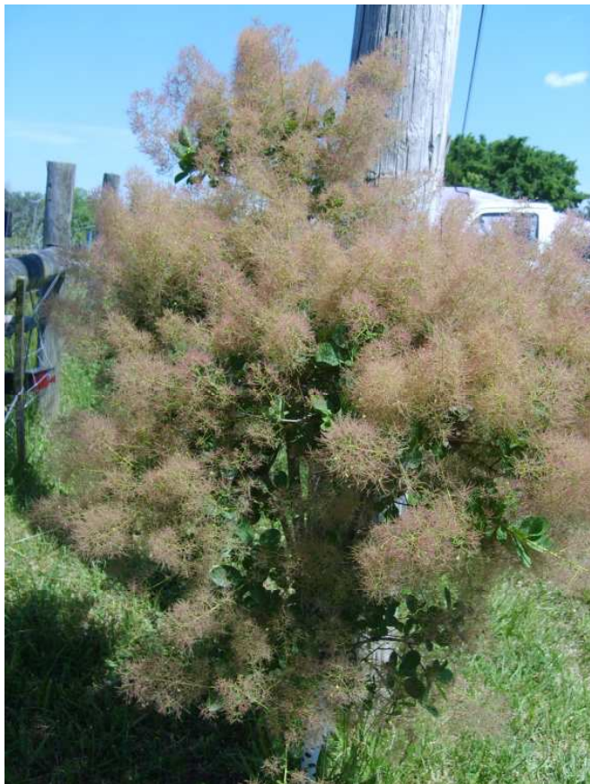
American smoke tree in bloom

It is more often grown as a medium or large shrub but will eventually become a small tree. Looks great planted in groups in a shrub border, and the long lasting display of 'smoke' makes it a showy accent plant.