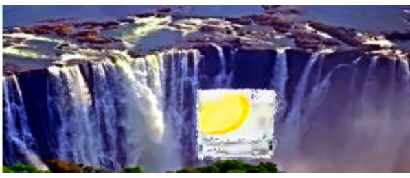
Filtered Water for good Health !!!