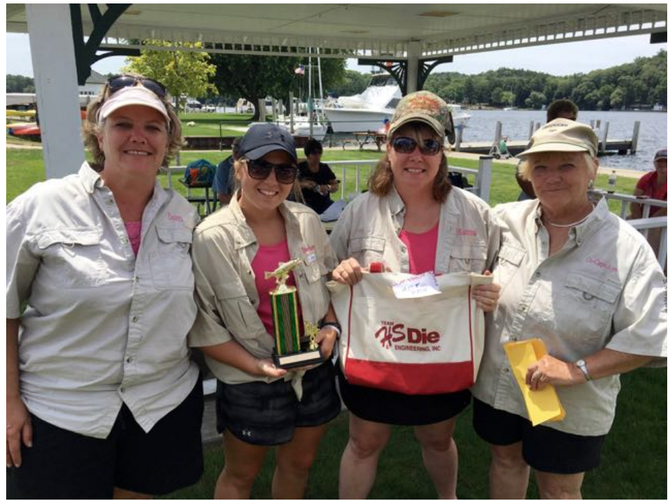
Producer Boat – 2<sup>nd</sup> Place – Most Fish