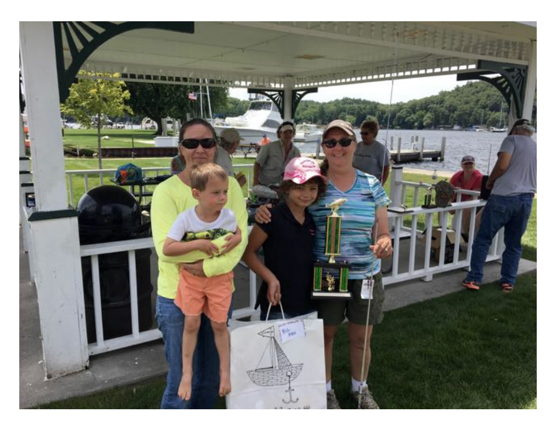
Sculpin Boat – Big Fish – First Prize