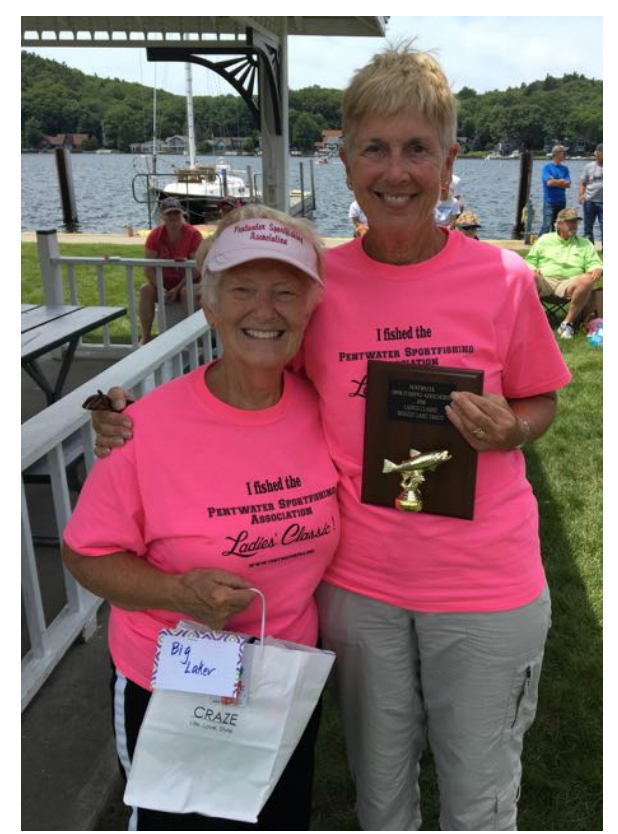
Son Seeker Boat – Big Lake Trout