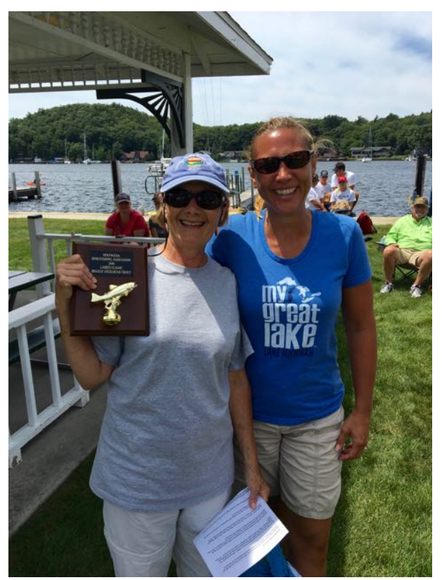
Reel Dancer Boat – Big Steelhead