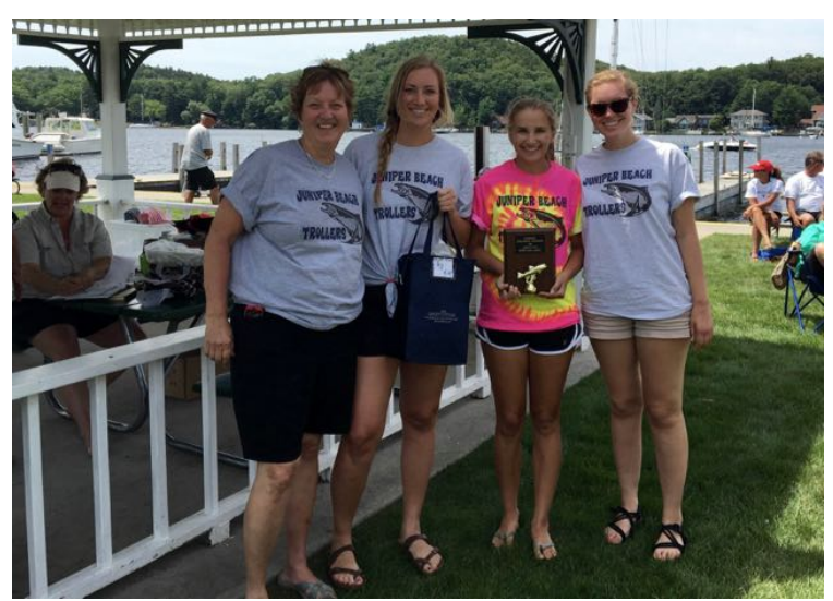
Juniper Beach Trollers – Big King