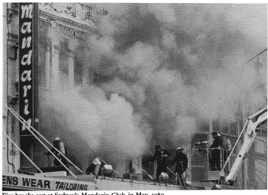
Fire breaks out at Sydney's Mandarin Club in May, 1980.

In organising for in-house fire protection, the club manager must understand his role in relation to that of his members, guests and staff, and demonstrate an awareness of the scope of the fire problem in terms of life and dollar loss.