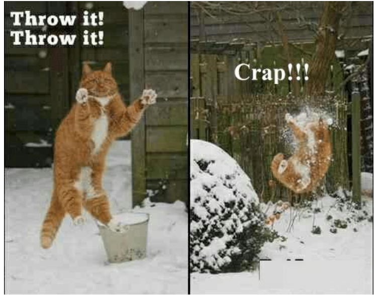
Cat snowball fight