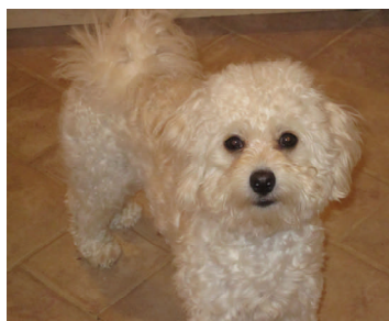
EVIE—Our PomaPoo (Poodle and Pomerian Mix)

Hardwoods to Avoid Since They Are Soft and Prone to Scratching :