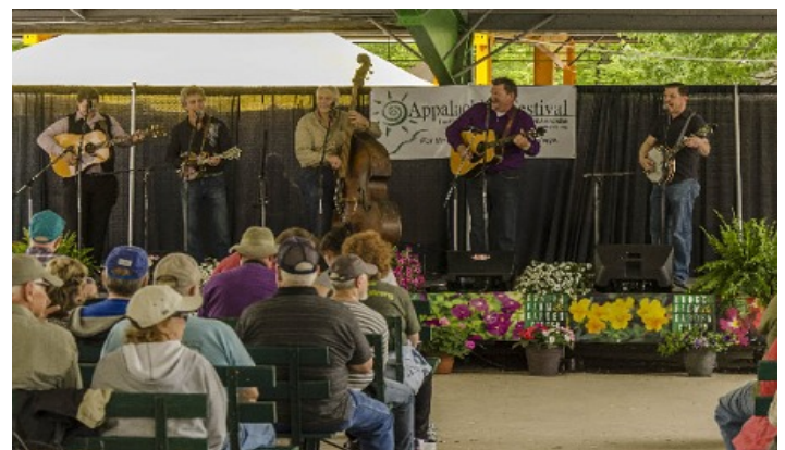
Two days of fun and entertainment. Don't stay home. COME TO THE APPALACHIAN FESTIVAL!!