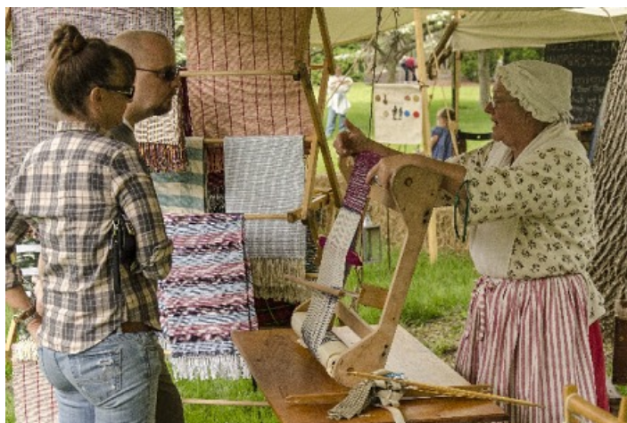
Quilters demonstrations. Ask questions and learn about this skill that might disappear. Goods for sale