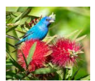
Blue Bunting With Flowers Mark Stracke