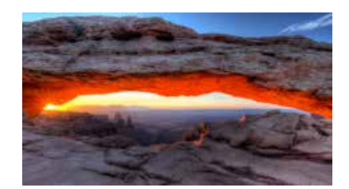
Mesa Arch