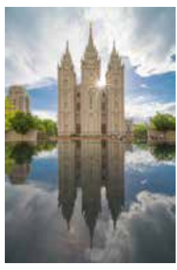
Salt Lake Temple