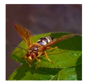
Cicada Killer Wasp