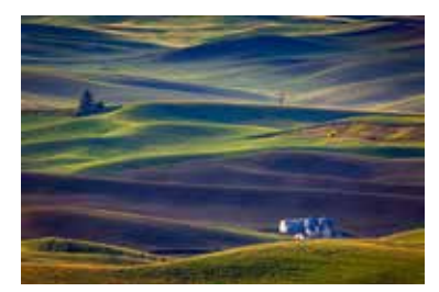
Early Morning Rose Epps