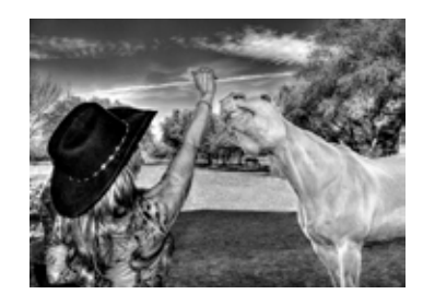
Snack Time Beverly Lyle