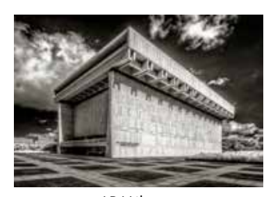
LBJ Library Pete Holland