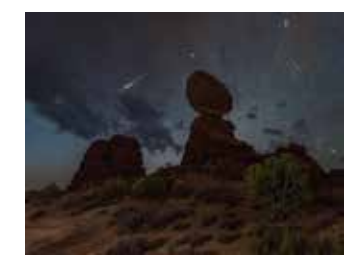
Perseid Meteor 2018