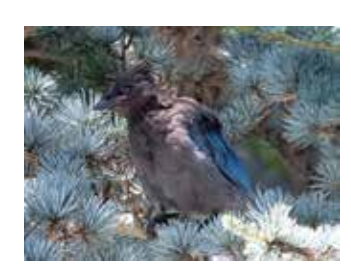
Juvenile Stellar's Jay-Big Sur