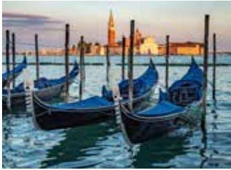
Gondolas at Sunset