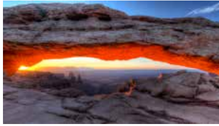
Mesa Arch