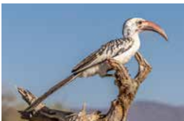
Red-Billed Hornbill