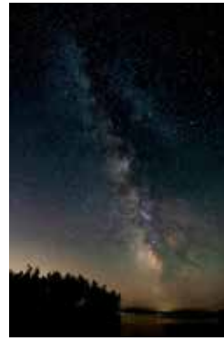
Milky Way Over Puget Sound