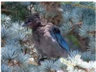
Juvenile Stellar's Jay-Big Sur