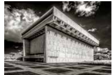
LBJ Library Pete Holland