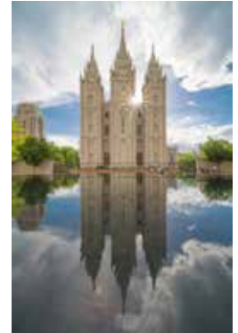
Salt Lake Temple