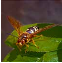
Cicada Killer Wasp