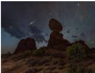
Perseid Meteor 2018