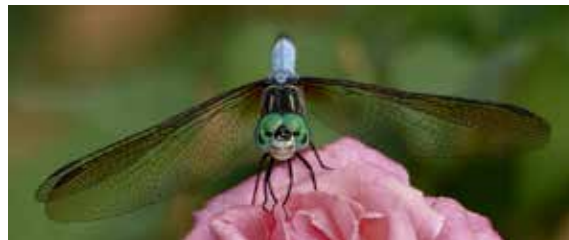
Dragonfly - Hill Country Water Garden Mike Stys