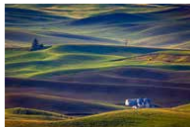
Early Morning Rose Epps