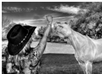
Snack Time Beverly Lyle