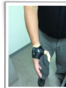
Shown connected to prosthetic socket