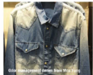
Odor management denim from Mou Fung

This denim uses the latest "Fresh Gear" technology from Hyosung to give it anti-odor performance.