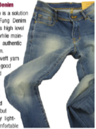
Vflexition Denim from Mou Fung

Stretch weft yarn provides good stretch and recovery for mens jeans. The fabric looks rigid and heavy, but it is actually lightweight, comfortable and stretchable.