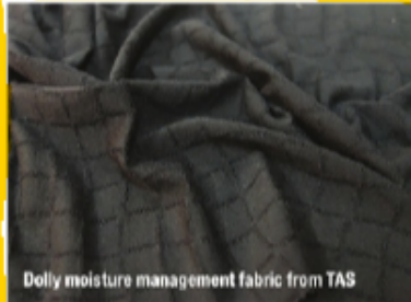
Dolly moisture management fabric from TAS

This collection from Tianhai Athleisure Solution provides wool-like benefits but in a more skin-friendly fabric. Strong moisture absorbent performance draws moisture away from the body, while the fabric's tiny air pockets provide warmth and a fluffy hand feel. It has excellent in-