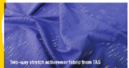
Two-way stretch activewear fabric from TAS

The needle-punched effect from Tianhai Athleisure Solution gives this two-way stretch fabric a unique look. This fabric is ideal for activewear where garments must not only look good, they need to perform as well.