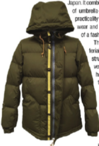
Minotech water repellent trim by Teijin

Minotech from Teijin Frontier Ltd. was inspired by the design of straw raincoats made in ancient Japan. It combines the usefulness of umbrella-quality fabric, the practicality of high-function wear and the attractiveness of a fashionable material.