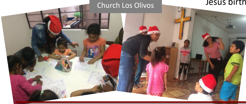
Church Los Olivos

In Los Olivos, the chocolatada and Christmas celebrations were particularly marked by the help of so many volunteers. Members of the church did the shopping for supplies, wrapping of gifts, making the hot chocolate and panéton and even the teaching of the Christmas story of Jesus birth.