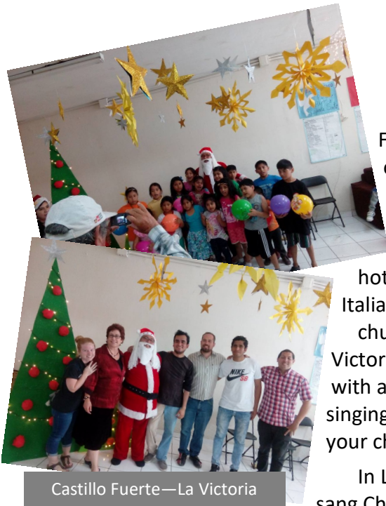
Castillo Fuerte—La Victoria

All of our churches and Castillo Fuertes celebrated the arrival of our savior's birth with a chocolatada. This common Peruvian Christmas tradition involves activities for the family and hot chocolate and panéton, an Italian fruit cake. Additionally our churches in Los Olivos and La Victoria celebrated Christmas eve with a candle light service and the singing of Silent Night as I'm sure many of your churches did as well.