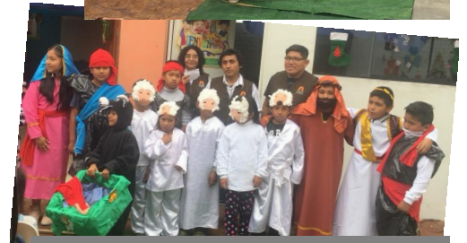
Castillo Fuerte—San Juan de Lurigancho

In San Borja, the English conversation group watched the Charlie Brown Christmas movie and practiced their English discussing American holiday traditions.