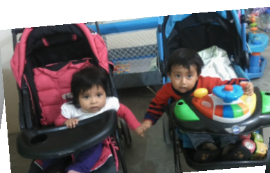
Left: the women at the church in Los Olivos Above: the babies at Castillo Forte Chorrillos