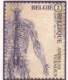
Medical stamps Page 28