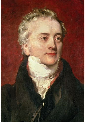
The French linguist Jean-François Champollion (left) ultimately cracked the Rosetta code, aided by earlier insights provided by the English polymath Thomas Young (right).

phonetic element in Egyptian scripts, this appears to have been unintentional, because he made one crucial exception in the Lettre, undoubtedly influenced by Young's prior work: Hieroglyphs could represent sounds when used phonetically to write foreign proper names in cartouches. This allowed Champollion to justify the Lettre's phonetic transliterations of the cartouches of many foreign rulers of Egypt, such as Alexander, Cleopatra, and Ptolemy, and its celebrated list of hieroglyphic and demotic "phonetic signs" supposedly used for writing only these foreign names.