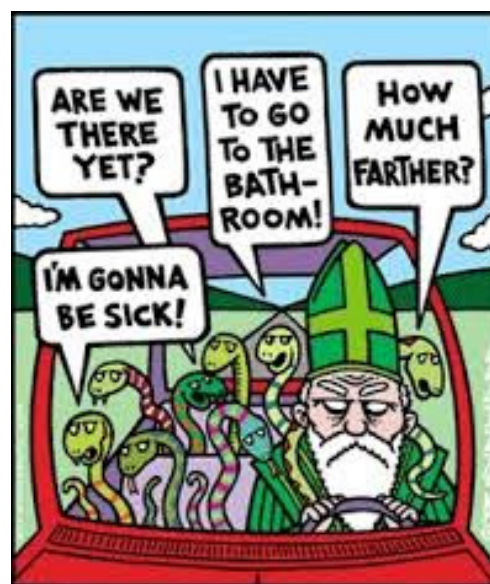
St. Patrick driving the snakes out of Ireland.

The Edelweiss Am Rio Grande German-American Club (GAC) is a private club and as such cannot solicit by advertising or otherwise participation in its events and activities to the general public. The IAS is an associate club of the GAC and all IAS members and their bona fide guests are welcome at all GAC events and IAS events held at the GAC.