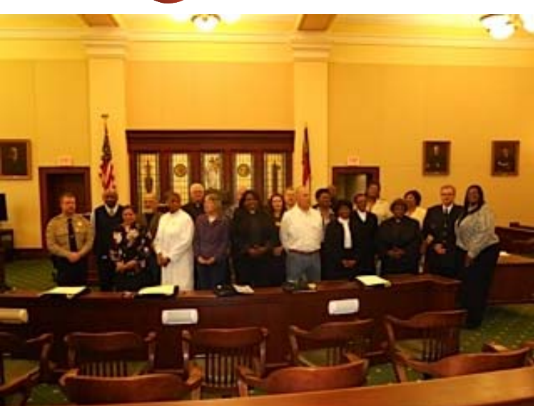
GREENVILLE, N.C. -Pitt County welcomes 20 chaplains to the Pitt County Sheriff's Office Chaplain's Program.

After seven months of classroom and field training, 20 chaplains from across Pitt County graduated from the first chaplain course at the sheriff's office on Saturday.