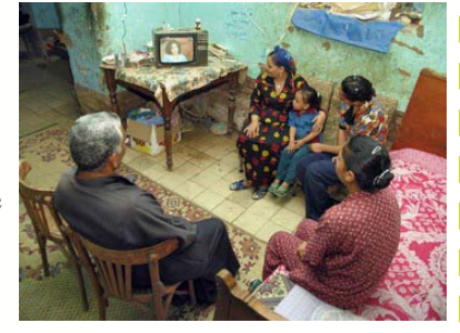
SAT7 is a bridge to isolated Christians

languages – Arabic, Farsi (Persian) and Turkish. Programs include talk shows on everyday issues and on questions of faith, where the Christian faith is explained. There are also religious services, plus magazine programmes and game shows. Especially popular, Sat7 reports, are documentaries, or "dramas," which retell biblical stories, fitting nicely with the long tradition of storytelling in the Middle East.