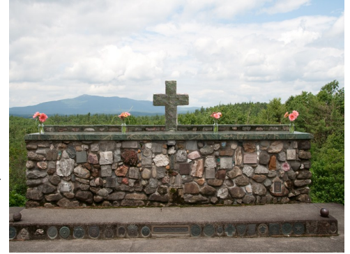
The Altar of the Nation was built in 1946 and recognized by Congress in 1957 as a National Memorial to American men and women who lost their lives in war.

This feature is adapted from July 2011 Diocesan Newsletter and published with permission