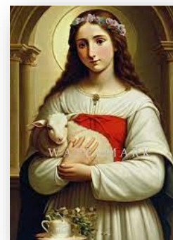
Feast Day: January 21

Sources: catholic.org and franciscanmedia.org