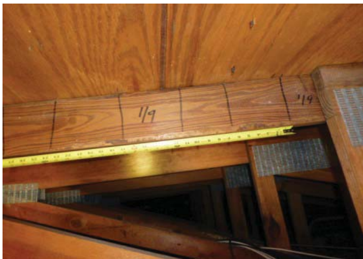
#3 ROOF DECK ATTACHMENT