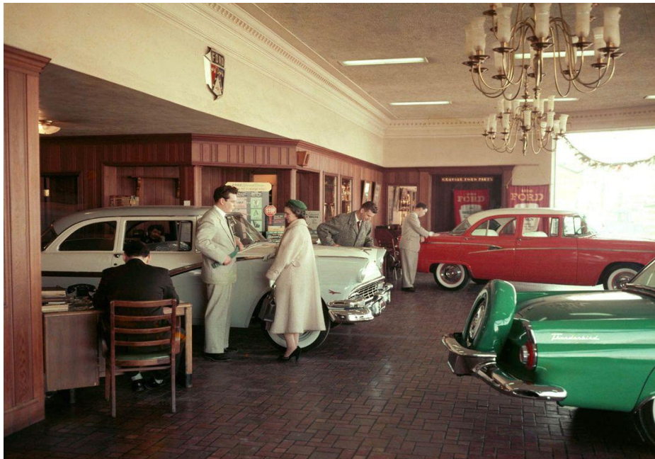
Typical ? Ford dealer in 1956.

Members attending a meeting are asked to RSVP to the host with at least a weeks' notice so the host can get a count of members attending and prepare as necessary. RSVP also means responding if not attending