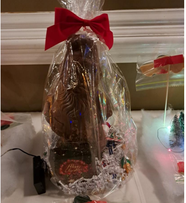
Chocolate Santa - yum, yum