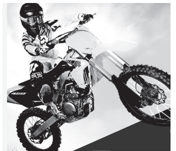
Photos depict professional rider on closed course.