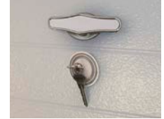
Outside keyed lock