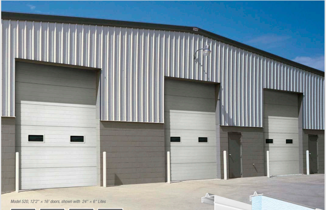
Model 520, 12'2" x 16' doors, shown with 24" x 6" Lites