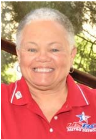
Michigan State USBC WBA Hall of Fame Metro Detroit USBC Hall of Fame Past - Director USBC Past - President Metro Detroit USBC