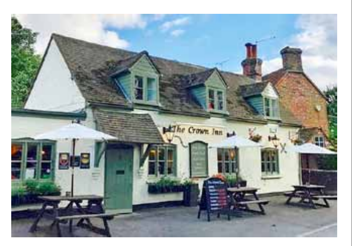
Saturday - Midday until late Food from Midday until 3pm, then 6pm to 8.30pm

Tuesday - Friday 4pm until late Food from 6pm until 8.30pm