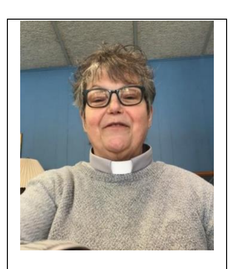
Grace & Peace from the Pastor's Desk

November is the time we usually set aside a time of Thanksgiving. A time to remember our blessings and celebrate them. As I review this past year I have so many blessings to give thanks for, most of all the chance to serve a loving, caring congregation, and the love of God that surrounds us in all times and all places, regardless of our circumstances.