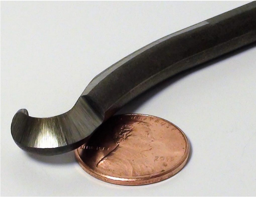
Making a hook tool