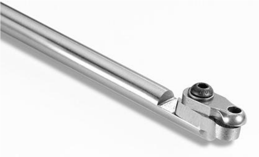
Hamlet-Deep Hollowing Tool