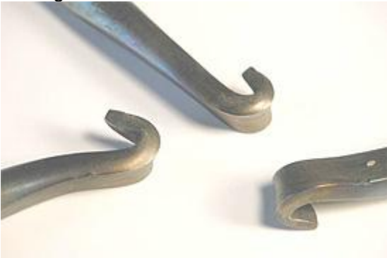
Hook Tool Bar by Tod Raines Tools