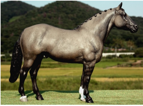
Pine (CM) 5-Polaris (SSt), 6-Tejas Little Eagle (CM)

Simple Remake & Repaint w/Hair M/T: Classic (3): 1-Imagineer (AC), 2-BR Danton (HC), 3-Amroth (CV)