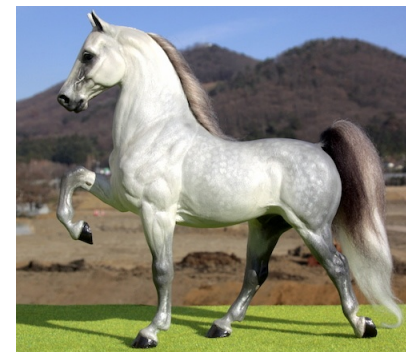
RES. CHAMPION GAITED BREED: IRON BUTTERFLY (AC)

Clydesdale/Shire (12): 1-Thunder in Paradise (AC), 2-Megazone Eve (AC), 3-Diamond Blue Rose (CR), 4-Dominion Blue Douglas (SSu), 5-Brigante (AC), 6-Sparrowood Beauty (SSu), 7-Castlekeep Mistress (LB), 8-Lady of Trieste (CM), 9-Royal Witch (AP), 10-Two Ton Tessie (AC), HM-Belle (HC)