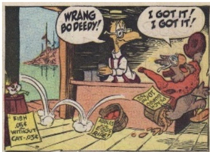
From "Pogo" by Walt Kelly