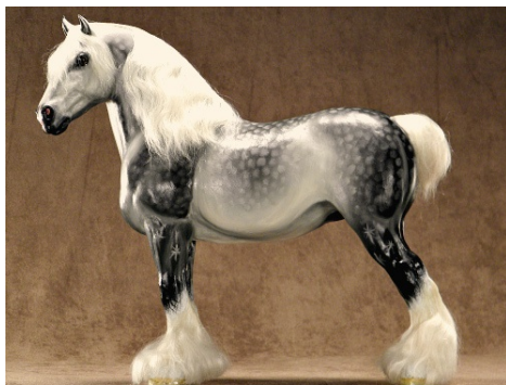
CHAMPION GREY/ROAN: RAS ELIAN DEMOISELLE (CM)

(JV), 5-Heinder-90 (CV), 6-KT Le Baron (CV), 7-Cinnamon (SSu), 8-Stormaway Zephyr (AC), 9-WV Heza KO (HC), 10-Autumn Storm (HC), HM-Highland Express (CM)