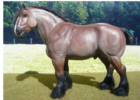
CHAMPION DRAFT BREED: DO BESSANCOUR MOULIN ROUGE (JV)

Other Pure or Mixed Draft Breed (10 -3 Judge's horses): 1-DO Bessancour Moulin Rouge (JV), 2-KT Le Baron (CV), 3-Pippilotta-Elmar (JV), 4-Wish He Wood (KM), 5-WV Heza KO (HC), 6-Blue Light Special (SSu), 7-Wishful Thinking (KM)