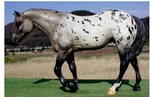
RES. CHAMP FLOCKED/OTHER CUSTOM: WATERS UNDER EARTH (CV)

1980s WORKMANSHIP DIV. OVER-ALL CHAMPION: GALIENT (AC)