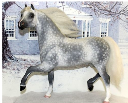
CHAMPION MAJOR REMAKE/REPAINT/HAIR OR SCULPTED MANE/ TAIL: *QUEST (HC)

Major Remake & Repaint w/Hair Mane/ Tail: Smaller than Classic and Major Remake & Repaint w/Non-Hair Mane/ Tail: Classic and Smaller than Classic: none