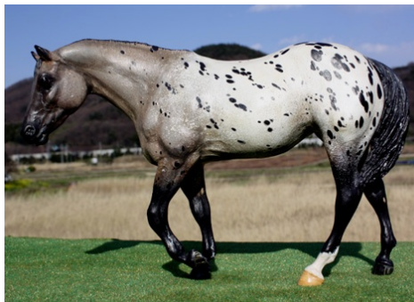
CHAMPION STOCK BREED: WATERS UNDER EARTH (CV)

Other Pure/Mixed Stock Breed (8): 1-Waters Under Earth (CV), 2-Bloodbath Highway (CV), 3-DQ Storm Warning (SSu), 4-Montana Cat (LB), 5-The Cimarron Kid (JV), 6-Banned From Argo (AC), 7-Nabina-bah The Bruce (CM), 8-Bourbon Express (SSu)