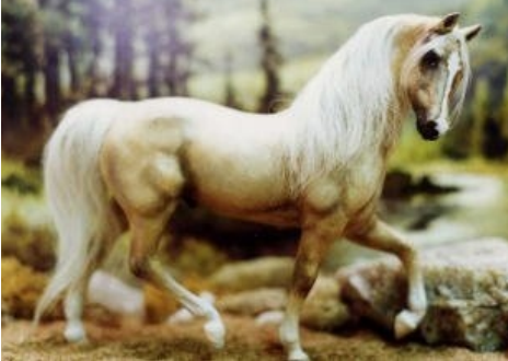
CHAMPION MAJOR REMAKE/REPAINT/HAIR OR SCULPTED MANE/TAIL: BROOKRIDGE GOLDENROD (AP)

1-Viper Mad Blues (CV), 2-Imagine That (SR), 3-Boris Badenov (CV), 4-The Rock (HC), 5-Shez Candu (HC)