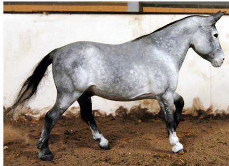
RESERVE CHAMPION LONGEAR/ EXOTIC/FANTASY: CUTACROSS SHORTY (SSu)

Stock Breed Foal (14): 1-Without A Doubt (AC), 2-LJ September Skye (JV), 3-DA Pep C Max (CR), 4-Impressive Too (JG), 5-LBR Zeke (JG), 6-MN Solitary Boy (HC), 7-PR Sunspot Baby (JV), 8-Shonen Champion (CV), 9-DQ Jupiter Jazz (CV), 10-DA Santorini Sunlit Days (JV), HM-PR Saskatoon Blues (JV)