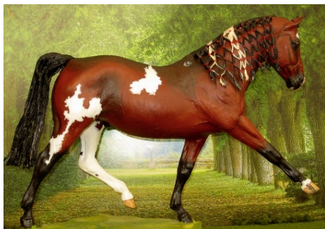
CHAMPION SPORT BREED: BON JOVI (NF)

Other Pure or Mixed Sport Breed (9 -1 Judge's horse): 1-DQ Konocit's Jet (CV), 2-Ethereal Breezy V (BK), 3-After Thoughts (HC), 4-Sunshine's Hardcore Chocolate (AC), 5-Tug Hill By Design (CM), 6-Heartlight (HC), 7-The Mad Cookie (CV), 8-Blood Music (CV)