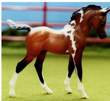
CHAMPION CUSTOM WITH FACTORY PAINT: FAIRUZA (AP)

Retouch/Partial Paint Removal/Etch on Factory Paint w/Non-Factory Mane/Tail and Remake and Retouch/Partial Paint Removal/Etch on Factory Paint w/Non-Factory Mane/Tail: none