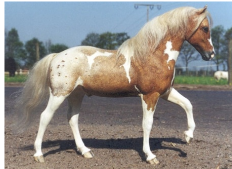
RES. CHAMPION OTHER COLOR: LBR ALBUQUERQUE (JG)

1990s COLOR DIVISION OVERALL CHAMPION: SHASTA (HC)