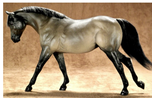
RESERVE CHAMPION CREAM/DUN COLOR: MISS SMOKUM ROYAL (CM)

Blanket Appaloosa (46 -2 Judge's horses): 1-Waters Under Earth (CV), 2-AMB Midnight Frosty (AC), 3-Lily Cat (AC), 4-Diamond Ruby Moon (JV), 5-Oak's Dun Purrfect (CM), 6-Shine On You Crazy Diamond (SR), 7-Go-Cart Mozart (AC), 8-Flammable Jammies (AC), 9-Foxy Robin J (JG), 10-Flashy Britches (CM), HM-Katarina (CM)