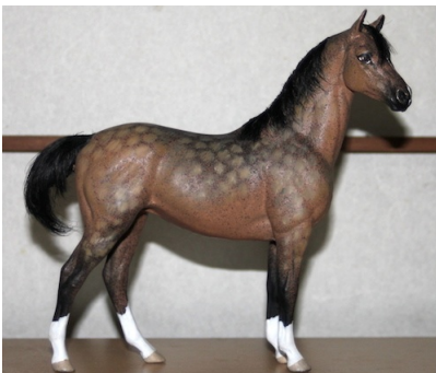
RES. CHAMPION SIMPLE REMAKE/ REPAINT/HAIR OR SCULPTED MANE/ TAIL: IMAGINEER (AC)

Major Remake & Repaint with Hair Mane/Tail: Trad. or Larger (12): 1-*Quest (HC), 2-Telemann (LB), 3-Rocking Chair