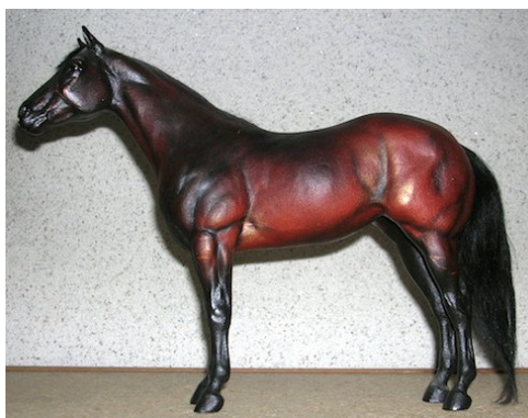
LJ AMERICAN BEAUTY