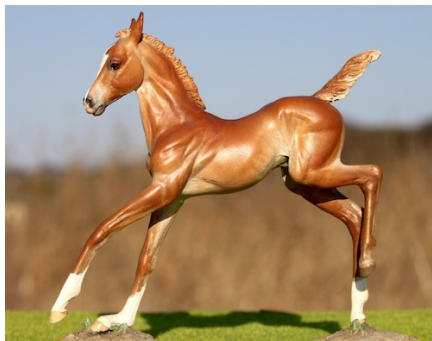
CHAMPION BASE COLOR: GOLDEN BOMBER (CV)

Black (20): 1-Beltrane (SR), 2-Summer of Night (AC), 3-RM Calliope (CV), 4-PC Fergus (CM), 5-Night Myst (BA), 6-KT Moonlight Serenade (JG), 7-Katana (SN), 8-Die Fledermaus (SSu), 9-Color of Night (BA), 10-Ladyhawke (BA), HM-PHF Modesty Blaise (JV)