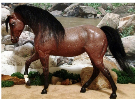
RESERVE CHAMPION GAITED BREED: MERRY MOUNTAIN MIST (AP)