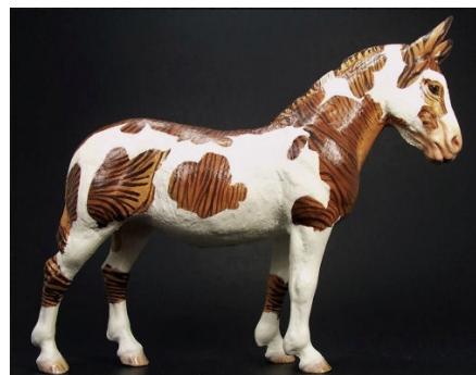
RES. CHAMPION EXTREME REMAKE/REPAINT/HAIR OR SCULPTED M/T: SHASTA (HC)

Flocked w/Flocked M/T and Remade & Flocked w/Flocked M/T: no entries