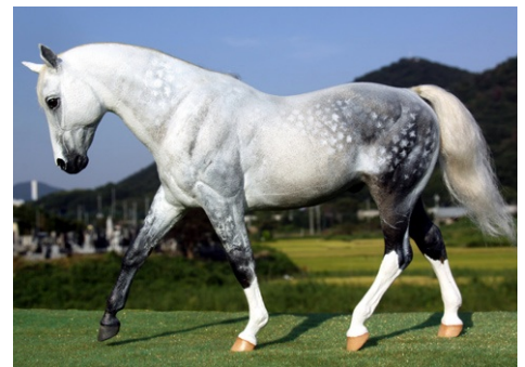
RESERVE CHAMPION SPORT BREED: THE BLUESMOBILE (AC)