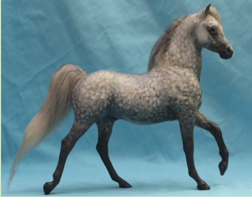
Ibn Hotep 40 Years Old!

CM by Ava Durbin in 1978 Owned by Suasn Stahl