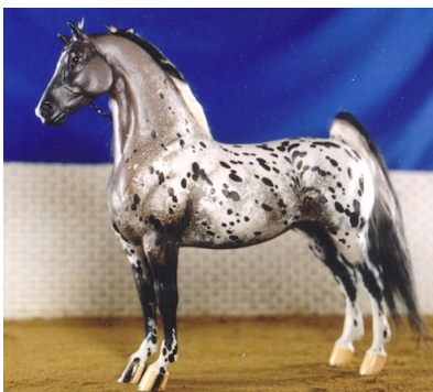
RES. CHAMPION GAITED BREED: MISTY THREE-KAY (AC)

Clydesdale/Shire (15 -2 Judge's horses): 1-RAS Elian Demoiselle (CM), 2-RM Nuclear Winter (KW), 3-KT Cracklin' Rosie (AC), 4-Deloyer Donald (AC), 5-Amazing Heart (SN), 6-Rumneyhill Victoria (SN), 7-Sparrowhood Rob Roy (SSu), 8-So Criminal (HC), 9-Deloyer Starblazer (AC), 10-Footprint Princess Royal (KM), HM-CS Dark Lord (AP)