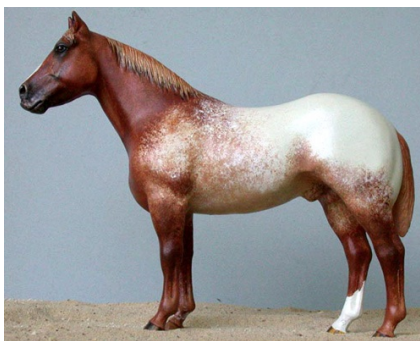
CHAMPION PONY/MINIATURE HORSE: WRANG BO DEEDY (AC)

Miniature Horse and Other Pure or Mixed Pony Breed: no entries