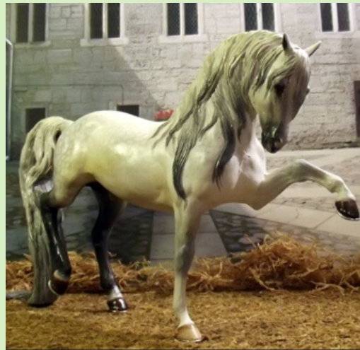
Aratoamin 20 Years Old!