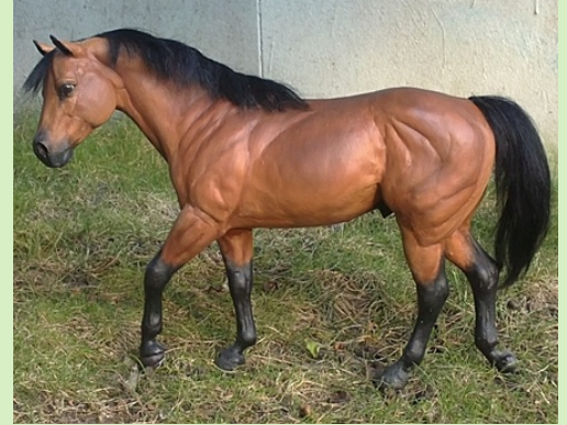
Desert Medallion 30 Years Old!

(Have one created in 1964, 1969, 1974, 1979, 1984, 1989, 1994, or 1999? Get it into the Birthday Barn spotlight by e-mailing its photo and info to our Gmail address below!)