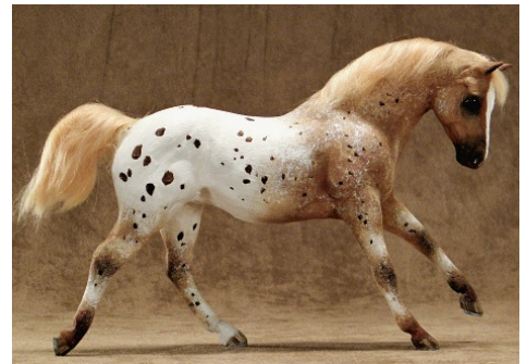
RESERVE CHAMPION EXTREME REMAKE/REPAINT/HAIR OR SCULPTED MANE/TAIL: DIAMOND PLAYTIME (CM)

Flocked w/Haired or Other Non-Flocked Mane/Tail (1): 1-Tug Hill By Request (CM)