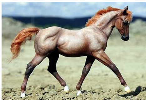
RESERVE CHAMPION GREY/ROAN: WITHOUT A DOUBT (AC)

Palomino (17 -2 Judge's horses): 1-Fire Dancing (CV), 2-SKS Mystic Aura (CM), 3-Tesoso D Oro (JW), 4-WV Aspen Gold (KW), 5-Glitters Like Gold (JV), 6-DA Hollywood Showgirl (JV), 7-KT Shadowdance (RN), 8-VF Whiter Shade of Pale (JV), 9-Goldion Hammer (AC), 10-Golden Malicious (SMB), HM-Foxy Moonshine (CM)