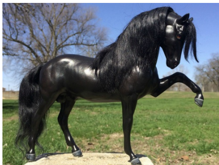
RESERVE CHAMPION BASE COLOR: BELTRANE (SR)

Dapple Grey (54 -2 Judge's horses): 1-RAS Elian Demoiselle (CM), 2-The Bluesmobile (AC), 3-Camelot's Hot T' Trot (CM), 4-D.O. November Day (RN), 5-GGK Tiqatu (SN), 6-Moonlight Cocktail (CV), 7-RM Nuclear Winter (KW), 8-Sea of Storms (CV), 9-Tonnerre Deveroux (SSu), 10-Ahvaz Sa-waalha (SN), HM-La Paska (SSu)