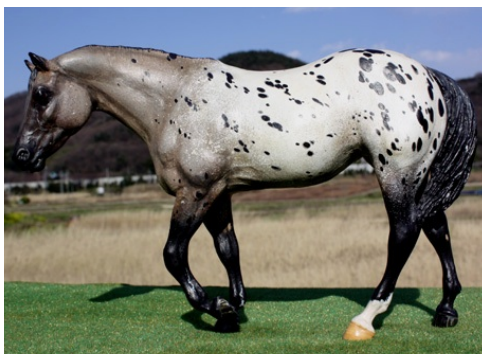
WATERS UNDER EARTH