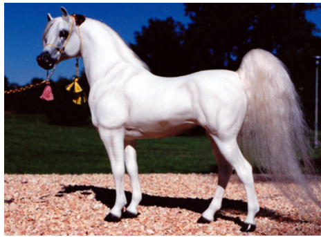
CHAMPION LIGHT BREED: RAS ZEN AMAKO (AC)

Other Pure or Mixed Light Breed (7 -1 Judge's horse): 1-KT Bunduki (RN), 2-Carolina Girl (SSt), 3-Fool's Gold (BA), 4-LJ Hit It Hal (SMB), 5-PR Malika Siglavia (JV), 6-Maskav (BA)