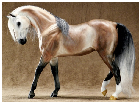
RES. CHAMPION SPANISH BREED: MALEGENA (CM)

American Saddlebred (16 -5 Judge's horses): 1-Highland's Captain Jack (NF), 2-MN Jackie O (HC), 3-Operation Meteor (AC), 4-Oingo Boingo (HC), 5-Crown Royale (BA), 6-Autumn Storm (HC), 7-Fall Sunrise (HC), 8-General Command (CC), 9-Capital Genius (HC), 10-Fudgesicle (HC), HM-Love N' Flames (CH)