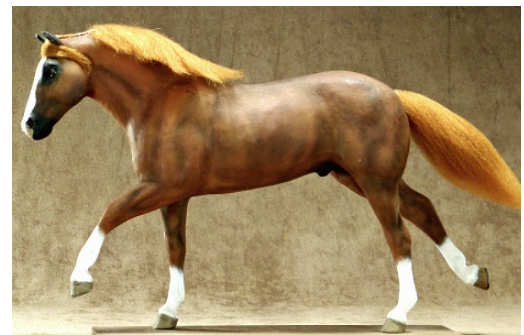
CHAMPION EXTREME REMAKE/ REPAINT/HAIR OR SCULPTED MANE/ TAIL: DIAMOND FANCY CAT (CM)

Extreme Remake & Repaint w/Non-Hair M/T: Classic and Smaller than Classic: no entries