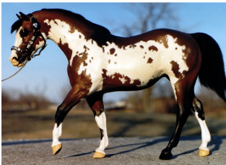
RESERVE CHAMPION PATTERNED COLOR: RM HEIWA (AC)

Longear/Exotic (8): 1-Ironwood Glenn (SSt), 2-Imagine That (SR), 3-Gallimaufry (SSu), 4-Pam-Mule-A (KW), 5-Belle Kabong (AC), 6-Bob (SSu), 7-Gentleman John (BH), 8-So Molson Canadien (SSu)