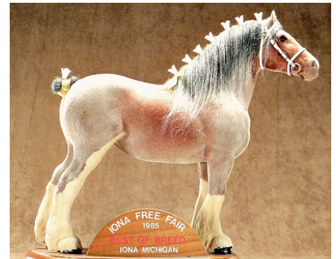
CHAMPION FLOCKED/OTHER CUSTOM: LADY OF TRIESTE (CM)

Goodbye Blue Monday (CV), 7-RM Miro (CV), 8-Phoenixbrook (AC), 9-How Far To Paradise (AC), 10-Antara Appalon (LB)