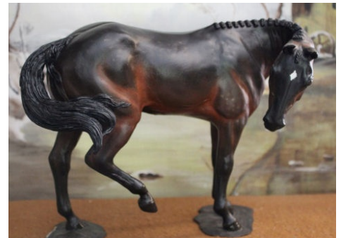
CHAMPION SPORT BREED: HHJ JULIET (HC)

Other Pure or Mix Sport Breeds (22): 1-The Bluesmobile (AC), 2-Kamtara Colorado Autumn (JV), 3-San Louie Obispo (AC), 4-PR Rosie O'Grady (JV), 5-Parklane Oystercatcher (JV), 6=PR Wharram Percy (JV), 7-Schneider (SSu), 8-Thunder Bolt (HC), 9-PR Murphy Brown (JV), 10-Mickey Scymon (AC), HM-Mr Darcy (SN)