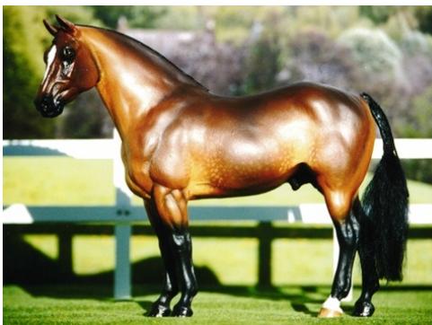
PR MURPHY BROWN