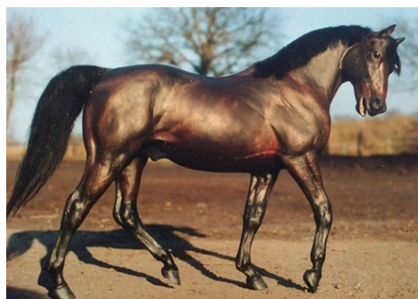
RESERVE CHAMPION SPORT BREED: COASTAL SLEW (JG)

Paso Fino/Peruvian Paso (8): 1-Encantador (CM), 2-Reynarda (AC), 3-Mago CDM (KM), 4-Tony Harken (AC), 5-Trueno Azul (CM), 6-Diamond Majestad (CM), 7-Stephano (JW), 8-Cancion De Amor (AP)