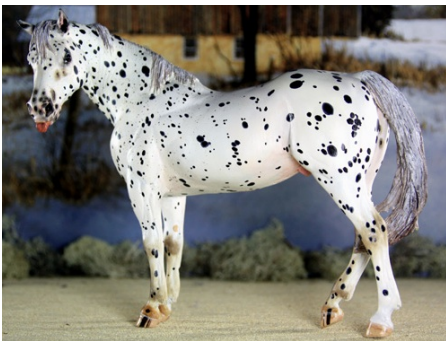
RESERVE CHAMPION PONY/MINI HORSE: DARK NAOTO (AC)

Longear (21): 1-Cutacross Shorty (SSu), 2-Churchy LaFemme (AC), 3-Jeb (SSu), 4-Tulpe (HC), 5-MN Elwood Blues (RN), 6-Rebel Yell (RN), 7-LJJ Lexy (HC), 8-Joshua (SSu), 9-Demeter (SSu), 10-Wylie (JG), HM-Josephine (HC)