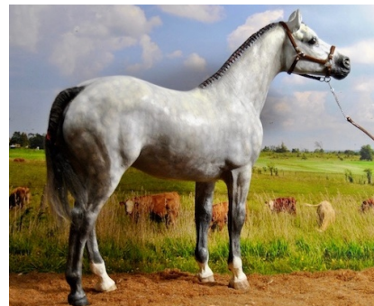
CHAMP. SPORT: PENNY ARCADE (BP)

Other Pure or Mixed Sport Breed (6): 1-Wing'd Jaguar (SSu), 2-Tadeusz (AC), 3-Flashover (SSu), 4-Jack of Hearts (AC), 5-Legendary (AC), 6-Flash of Gold (AC)