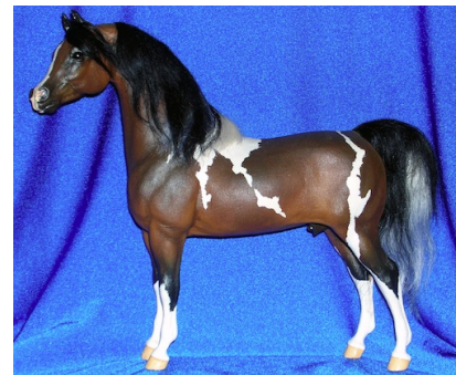
RESERVE CHAMPION LIGHT BREED: IBN FADJUR (CV)

Thoroughbred (19): 1-Coastal Slew (JG), 2-Assassin Slew (AC), 3-Phoenixbrook (AC), 4-Gate Dancer (AC), 5-Risque Business (KW), 6-Listentotheechoes (AC), 7-Jersey Boots (BP), 8-Phantom Wolf (SR), 9-Winterfell (KW), 10-Sun's Quatsch (SN), HM-Sioux City Slew (AC)