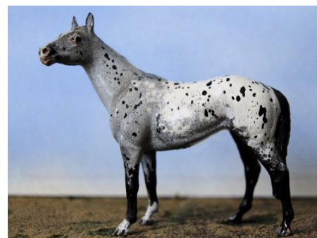
RES. CHAMPION SPORT: WING'D JAGUAR (SSu)

Paso Fino/Peruvian Paso (1): 1-Trigger Mortis (AC)