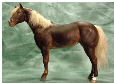
RES. CHAMPION STOCK: CUTTER'S POKEY PINE (CM)

Arabian (23): 1-Mustafa Bey (CV), 2-Andro Umeda (SMB), 3-AI Ouisha (SN), 4-*Quest (HC), 5-Ancalime (KW), 6-Sasaki (AC), 7-Nhi Vanye I Chyya (LB), 8-Telemann (LB), 9-Wizards Vale Constellation (SSu), 10-lbn Hotep (SSu), HM-*The Raisuli (CH)