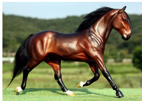
CHAMPION EXTREME REMAKE/REPAINT/HAIR OR SCULPTED MANE/TAIL: NIATROSS (AC)

Extreme Remake & Repaint w/Non-Hair Mane/Tail: Smaller than Classic (8): 1-RM Sophiia (CV), 2-Tundra Rumbles (CV), 3-Carolina Girl (SSu), 4-Creamsicle (H)C, 5-RM Calliope (CV), 6-Wellsley (HC), 7-Meghan's Hope (HC), 8-Footprint Princess Royal (KM)