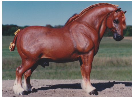
CHAMPION EXTREME REMAKE/REPAINT/HAIR OR SCULPTED MANE/TAIL: GALIENT (AC)

Extreme Remake & Repaint with Non-Hair Mane/Tail: Smaller than Classic (1): 1-LL Tidal Wave (HC)