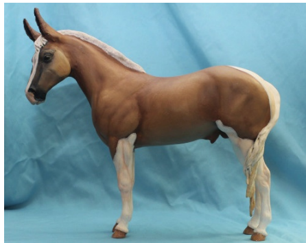
RES. CHAMPION OTHER COLOR: IRONWOOD GLENN (SSt)

1980s COLOR DIVISION OVERALL CHAMPION: FREUDIAN SLIP (AC)