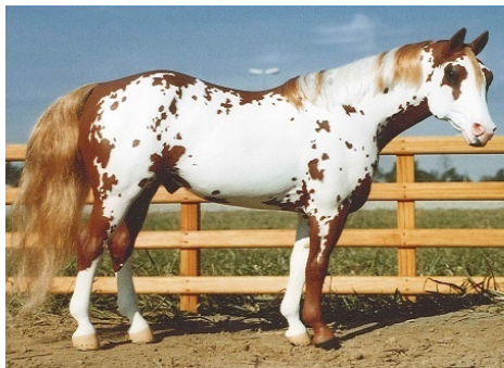
RES. CHAMPION PATTERNED COLOR: SPECIAL PRINT (RN)

Longear/Exotic (36): 1-Shasta (HC), 2-Quagga (JG), 3-Miss Moody (HC), 4-Fancy Feather Too (AC), 5-Jeb (SSu), 6-Churchy LaFemme (AC), 7-Demeter (SSu), 8-Jewels (HC), 9-Waltzing Matilda II (HC), 10-Zambezi (KW), HM-Xisa (HC)