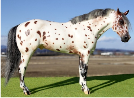
CHAMPION PATTERNED COLOR: WILDBEAT IRONGEAR (AC)

Sunshine Returns (RN), 10-Moonlight Serenade (HC), HM-MN Moonlight Drive (HC)