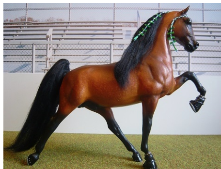
CHAMPION GAITED BREED: PR VALPARAISO KILLER INSTINCT (JV)

Other Pure or Mixed Gaited Breed (10 -2 Judge's horses): 1-Misty Three-Kay (AC), 2-LBR Albuquerque (JG), 3-Foxy Moonshine (CM), 4-Ima Travelin' Man (CM), 5-Sparkling Chablis Z (CM), 6-Thumbs Up (HC), 7-Hit The Switch (SSu), 8-Glitters Like Gold (JV)