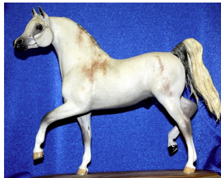
RESERVE CHAMPION EXTREME REMAKE/REPAINT/HAIR OR SCULPTED MANE/TAIL: OSIRIS (AC)

Flocked with Flocked M/T and Remade & Flocked with Flocked M/T: no entries