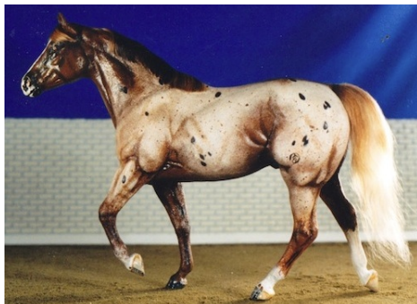
RESERVE CHAMPION STOCK BREED: AMANO JACK (CV)

Arabian (56 -1 judge's horse): 1-Osiris (AC), 2-Ryo Asuka (AC), 3-Serenity Syn Silver (CM), 4-Tabari (SSu), 5-Metropolitan (AC), 6-Mon Nafa Rani (CR), 7-Fox Maiden (AC), 8-FO Oparan (SSu), 9-*Nabour (CV), 10-Ahvaz Orashahn (SN), HM-*Shariah (AP)