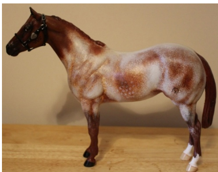
CHAMPION GREY/ROAN: RHAPSODY REDFORD (LB)

Roan (26 -1 Judge's model): 1-Rhapsody Redford (LB), 2-Cyrano Jones (LB), 3-KT Continental Rose (CM), 4-Cyberlena San (JG), 5-Naite Waratte (AC), 6-DQ Twilyte Image (SSu), 7-Lady of Trieste (CM), 8-Simmerl (SN), 9-Trueno Azul (CM), 10-So Blue Mio (AC), HM-Stupefyin' Jones (CM)