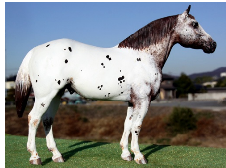
RES. CHAMPION FLOCKED/OTHER CUSTOM: TINY HARPER (AC)

1960s/1970s WORKMANSHIP DIV. OVERALL CHAMPION: DIAMOND FANCY CAT (CM)