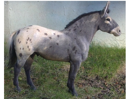
CHAMPION FLOCKED/OTHER CUSTOM: WYLIE (JG)

Any Other CM Not Listed Above (9): 1-Dark Naoto's Li'l Squeak Toy Riot (AC), 2-Jewels (HC), 3-Superbly Dunn (SSu), 4-Tetrasina (KW), 5-Rheinolt (SSu), 6-Beakman (SSu), 7-Millionar (NF), 8-Tug Hill Pokey Dott (CM), 9-Monopoly (JB)