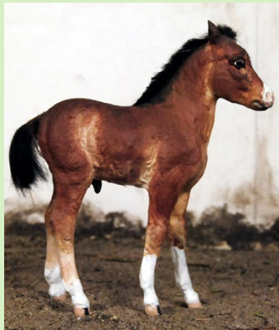
Nummy Muffin Coco Butter 25 Years Old!