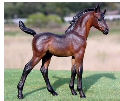
RES. CHAMPION FOAL: AKASHA (AC)

1960s/'70s BREED DIV. OVERALL CHAMPION: ROCKING CHAIR RENEGADE REVEL (CM)