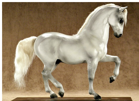
RESERVE CHAMPION SPANISH BREED: KT SIGLAVY XI AFRICA (CM)

ASB (23): 1-Iron Butterfly (AC), 2-Isaac Godunov (CV), 3-Manchester Memory (JW), 4-Slamdunk Diamond (AC), 5-S&M Flirtation Device (AC), 6-Yellow Dancer (AC), 7-Sir Arthur (HC), 8-Rocket Gibraltar (CV), 9-Highland Heartbreaker (SSu), 10-Grey Mercedes (SSu), HM-Society's Silver Denmark (AC)