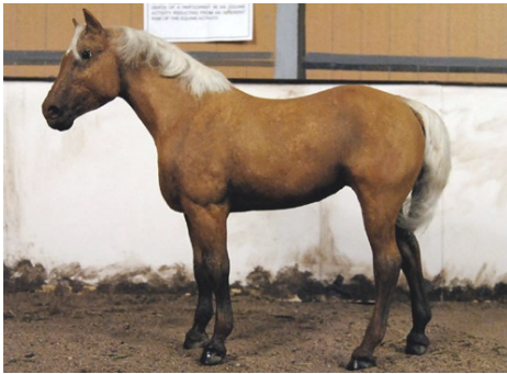
CHAMPION SIMPLE REMAKE/ REPAINT/HAIR OR SCULPTED MANE/ TAIL: SUMMER BREEZE (SSu)

Simple Remake & Repaint w/Non-Hair M/T: Classic (1): 1-The Pied Viper (AC)