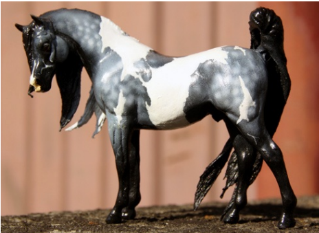
RES. CHAMPION MAJOR REMAKE/REPAINT/HAIR OR SCULPTED MANE/TAIL: VIPER MAD BLUES (CV)

Extreme Remake & Repaint with Hair Mane/Tail: Trad. or Larger (198): 1-Galient (AC), 2-LBR Donar (JG), 3-Miss Smokum Royal (CM), 4-Paramount Precision (AC), 5-Quick Comet (AC), 6-So Blue Mio (AC), 7-Sunshine's P.O. Plenty (AC), 8-Turbo Twist (CM), 9-Wicked Speedia (AC), 10-Yellow Dancer (AC), HM-Wolf Typhoon (AC)