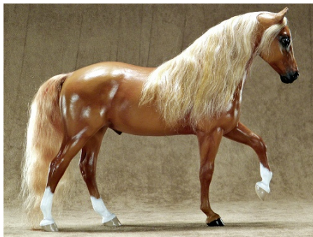
CHAMPION SPANISH BREED: ENCANTADOR (CM)

Other Pure/Mixed Spanish Breed (5 -1 Judge's horse): 1-KT Siglavy XI Africa (CM), 2-Pampapaul IV (JV), 3-Pavlova (SSt), 4-Ima Believer (CR)