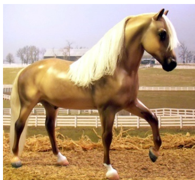
CHAMPION SPANISH BREED: TESORO D ORO (JW)

Other Pure or Mixed Spanish Breed (8): 1-Malegena (CM), 2-Siglavý Seiko (CV), 3-Gateado Mancho (AC), 4-KT Danza de Oura (CM), 5-RM Sophiiaa (CV), 6-Encaje (SSt), 7-Pluto Estaria (BA), 8-Lucullian (HC)