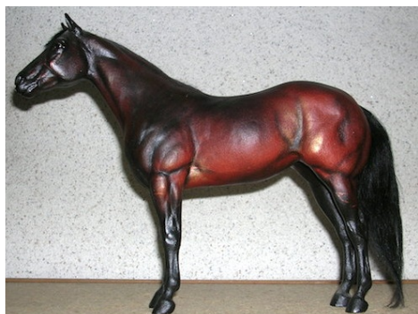
CHAMPION BASE COLOR: LJ AMERICAN BEAUTY (SMB)

Black (19 -1 Judge's horse): 1-Indiana Lawman (LB), 2-Nyx (AC), 3-LBR Donar (JG), 4-Brigante (AC), 5-Blackhawk (AP), 6-Dessaiz (AC), 7-Sun's Quatsch (SN), 8-Warm Leatherette (AC), 9-RM Zakuro (CV), 10-RM Saki (CV), HM-PX Le Corbeau (JV)