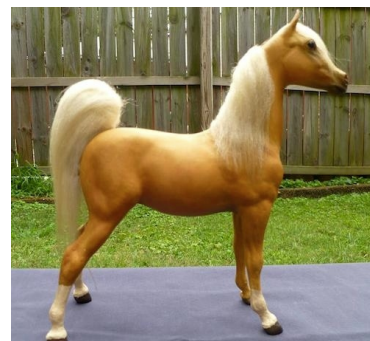
RES. CHAMPION CREAM/DUN COLOR: SUNSET'S GOLDEN DREAM (AC)

Blanket Appaloosa (16): 1-Rocking Chair Renegade Revel (CM), 2-Wrang Bo Deedy (AC), 3-Wing'd Jaguar (SSu), 4-Azure Lady (SSt), 5-Joker's Dice (AC), 6-Diamond Playtime (CM), 7-Chief's Jersey Squire (SSu), 8-Lady Red Diamond (AP), 9-Sage Wind (CH), 10-Diamond Seonee (AC), HM-Jack of Hearts (AC)