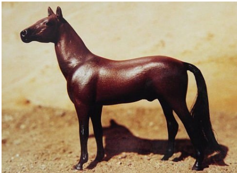
RES. CHAMPION MAJOR REMAKE/REPAINT/HAIR OR SCULPTED MANE/TAIL: MASKAV (BA)

Extreme Remake & Repaint w/Hair M/T: Trad. or Larger (106): 1-Abraxas (AC), 2-Brookridge High 'N Mighty (CC), 3-KT Scudbuster (JG), 4- KT Shadowrama (CV), 5-Operation Meteor (AC), 6-Rowrbazil (AC), 7-Siglavy Seiko (CV), 8-Sunny Beach (CM), 9-RM Nuclear Winter (KW), 10-Misty Three-Kay (AC), HM-Jeb (SSu)