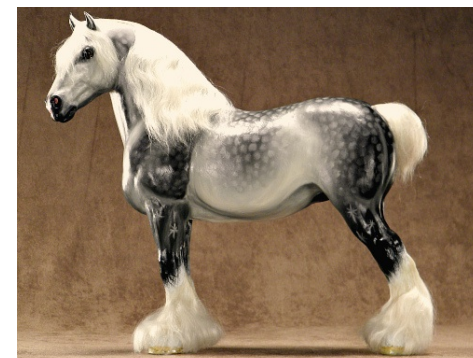
RES. CHAMPION DRAFT BREED: RAS ELIAN DEMOISELLE (CM)

American Pony (12): 1-Dark Naoto (AC), 2-Abayo Fly Bye (AC), 3-Ambrosea (CM), 4-DP Reckless (JW), 5-RM Winkin' at the Moon (AC), 6-Slri's Sly Delilah (AC), 7-Mystic Pumpkin (HC), 8-Space Cowboy (CV), 9-Harmon Irongear (CV), 10-Florida Jewel (JG), HM-LJ Abby Someone (CV)