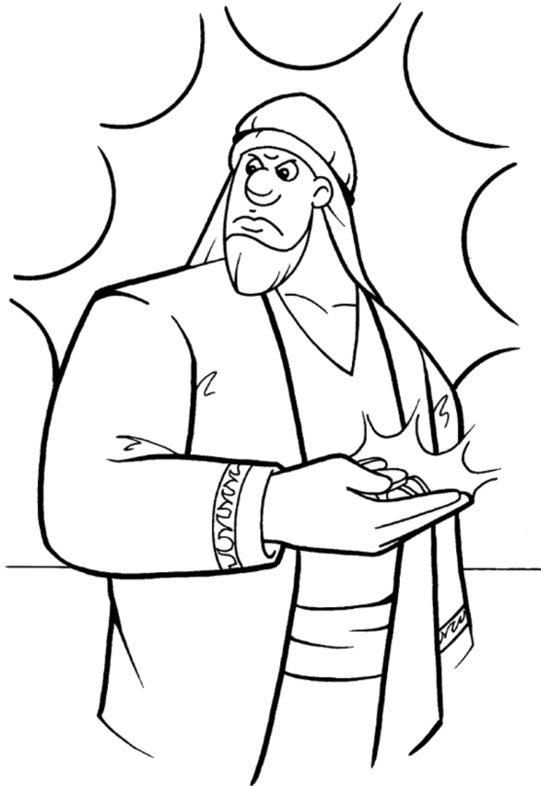
The Parable of the Talents Matthew 25:14-30