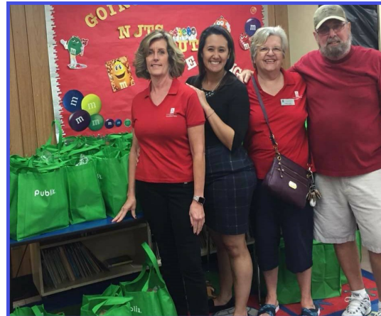
SI Homestead Thanksgiving Turkey Give-a-way.