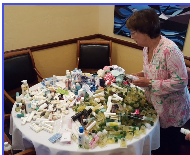
SI Homestead preparing sex trafficking bags.