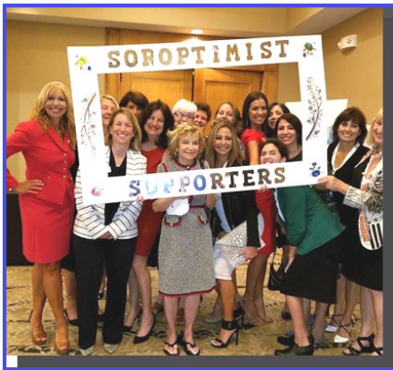
Soroptimist Boca Raton / Deerfield Beach 2017 Women of Distinction Breakfast.