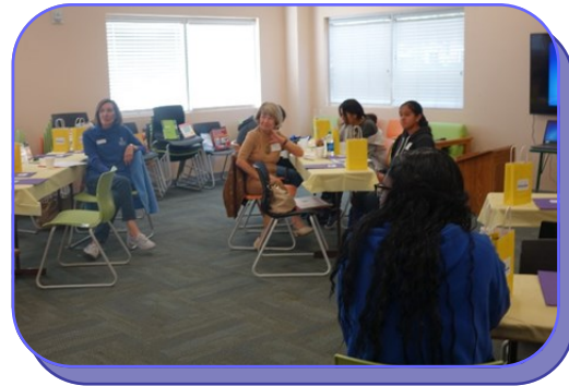
SI Pinellas County Dream It, Be It One Day Workshop with girls (left) and tables with Soroptimist guides (right)