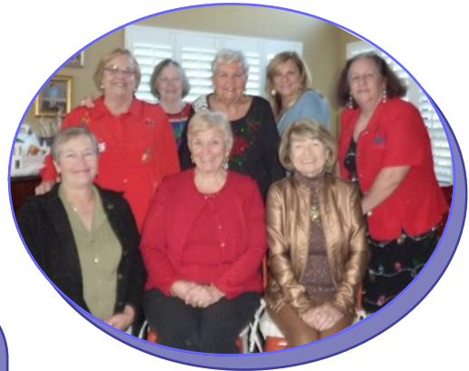
SI Pinellas County celebrating together.