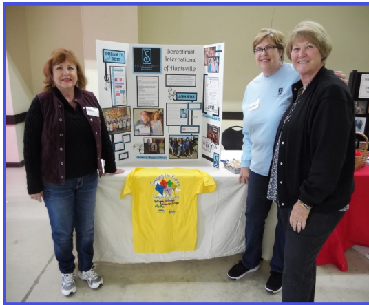
SI Huntsville has a display at the Community Kite Festival.