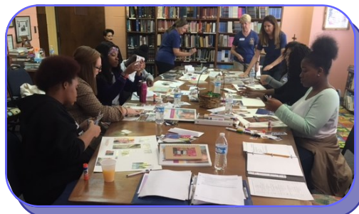
Dream boards, Zumba, fun and learning all part of a days work for Dream It, Be It in Nashville.