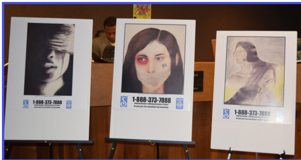
SI Davie held their 4 th annual Human Trafficking Art Poster Contest on January 18, 2018. We awarded cash prizes to our 1 st , 2 nd and 3 rd place winners. We also presented 25 filled back packs to our local police departments, BSO, and Florida Department Law Enforcement for their Human Trafficking efforts.