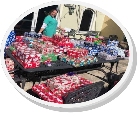
SI Homestead with their holiday donations.