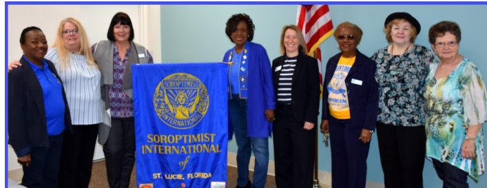
SI St Lucie hosted a Human Trafficking Symposium.