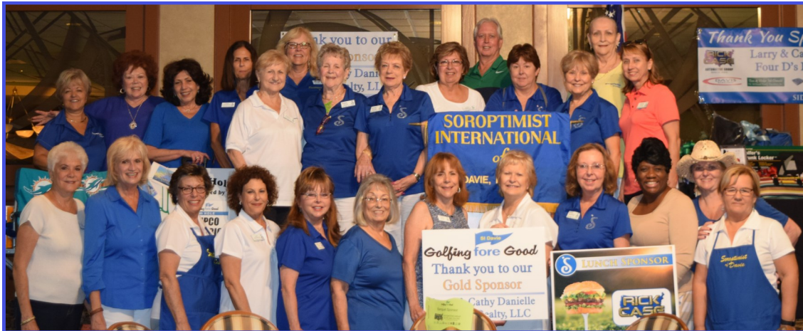
SI Davie 23rd annual Golfing Fore Good tournament. The funds help support SI Davie scholarship programs, the annual Human Trafficking Event and our local community partners.