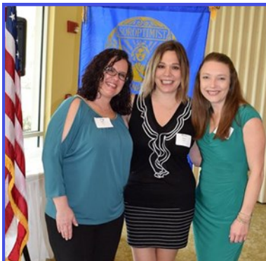
SI Pinellas County awarded $5,000 to these three Live Your Dream award winners.