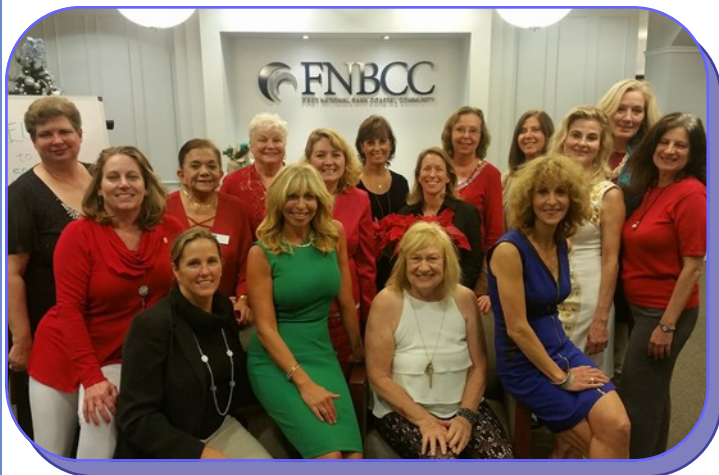
SI Boca Raton/Deerfield Beach ready to party!