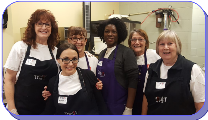
For SI Tampa's January Service Project they served breakfast to members of the local community at Trinity Cafe.