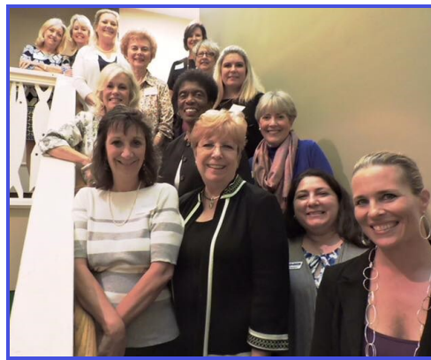
SI Stuart past Women of Distinction winners.