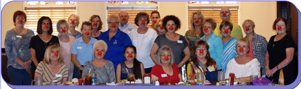
At a recent SI Davie meeting, the members celebrated "Red Nose" day.