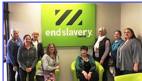
SI Music City Nashville members toured the new facility for End Slavery TN, the human trafficking organization we support.