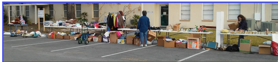
SI Tampa members working their flea market/garage sale fundraiser in February.