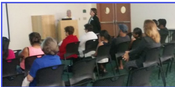
SI Pinellas County hosted a Human Trafficking seminar at the Clearwater Library in Spanish.