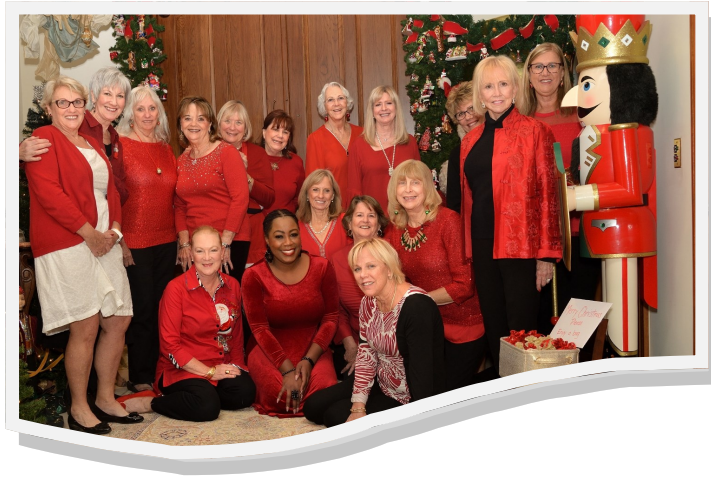
Here the members celebrate after delivering gifts they buy for each family.