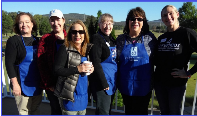
SI Huntsville members dressed to work!