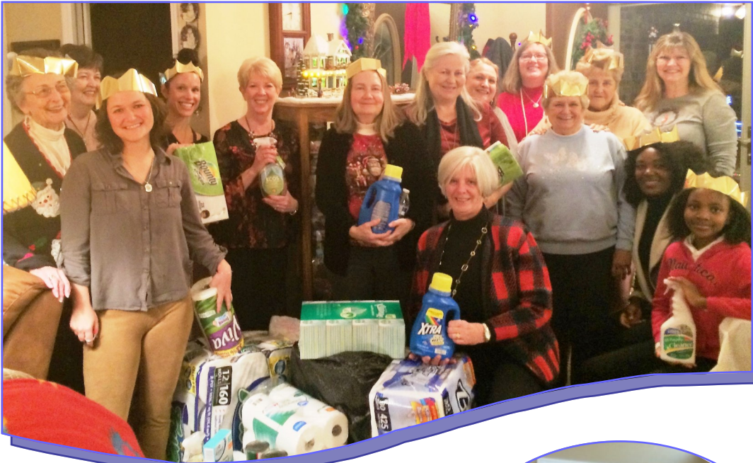
SI Music City Nashville enjoys each other and shows off the paper products collected for trafficking survivors.