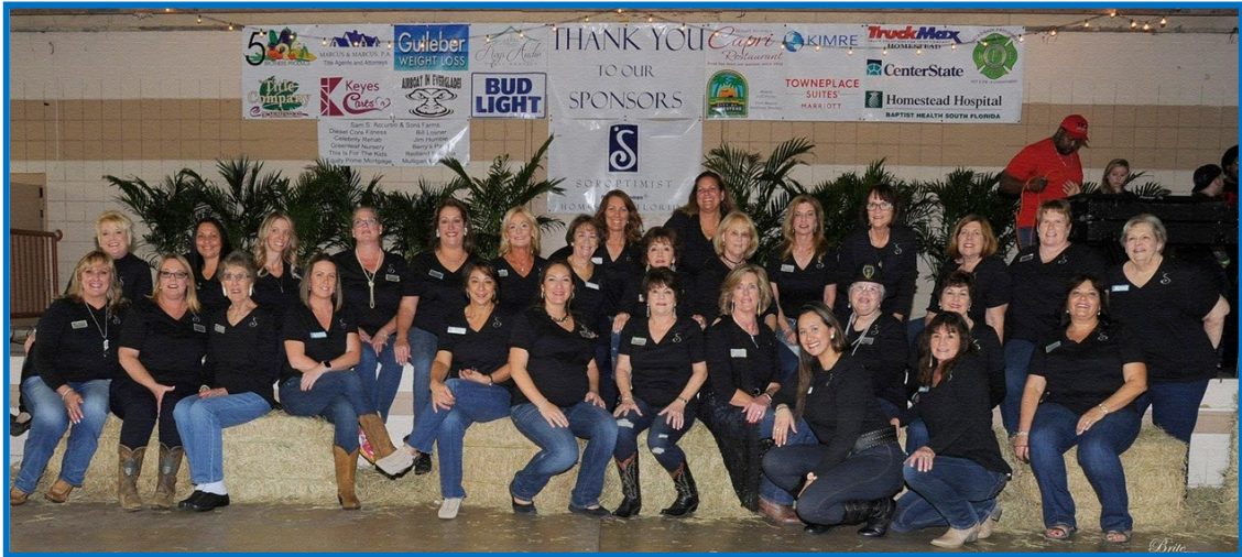
SI Homestead rocked the rodeo!