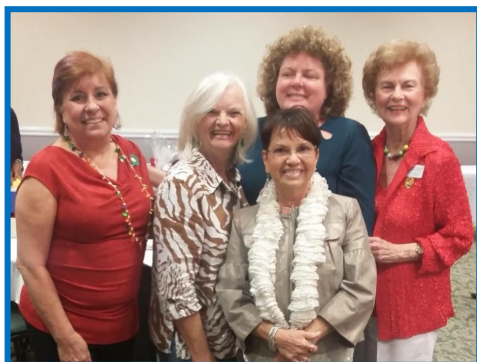
SI Stuart joins SI St. Lucie for Bingo!