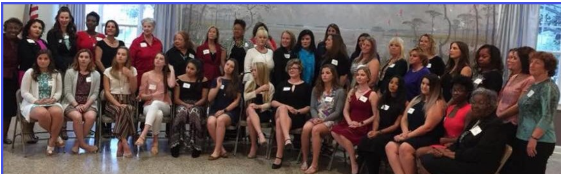
SI Stuart Women of Distinction nominees 2018.