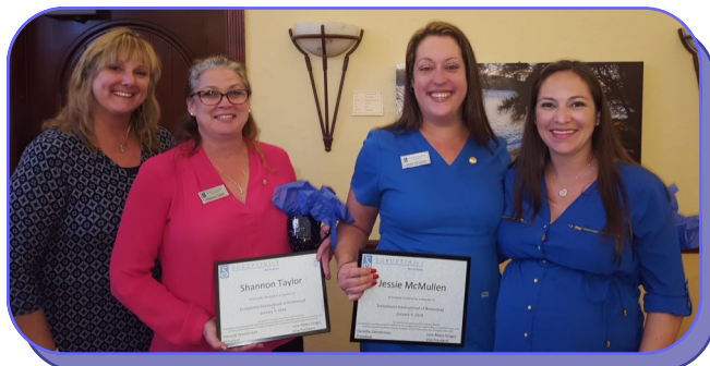
SI Homestead with their new members.