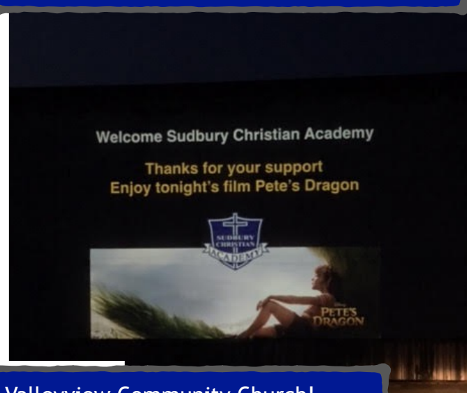
SCA kicked off back-to-school with a drive-in movie night @ Valleyview Community Church!