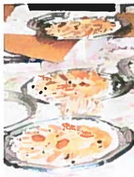
"Behind the scenes" in the te bach prep room...

We greatly appreciate the dedication of all who helped to make this event such a successful one.