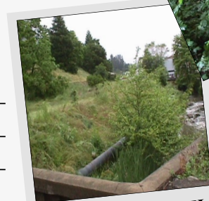
EL DORADO TRAIL

Great idea! Walk from the Park & Ride to the Farmers Market.