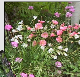
GARDENS & PROJECTS

Wow! El Dorado Trail in Downtown Placerville.