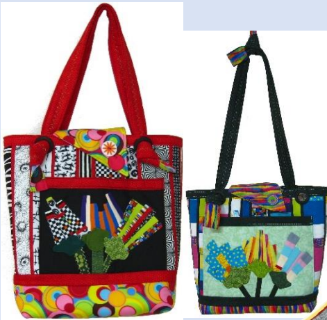
Sam's Tote Bags