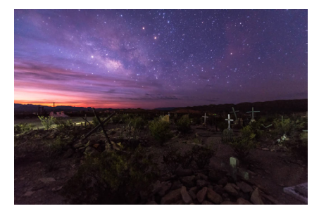
Ghost Town Cemetery, Terlingua James Hicks