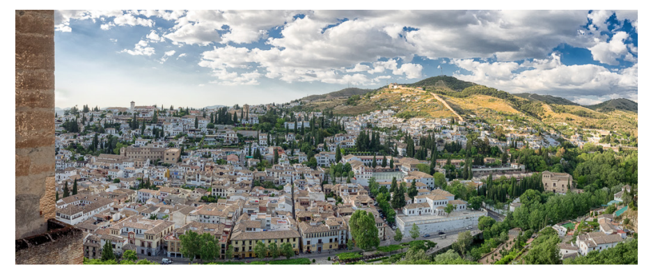
A View into the Past Bruce Lande