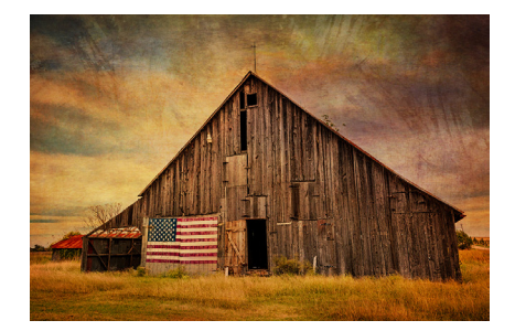
Patriotic Barn Rose Epps