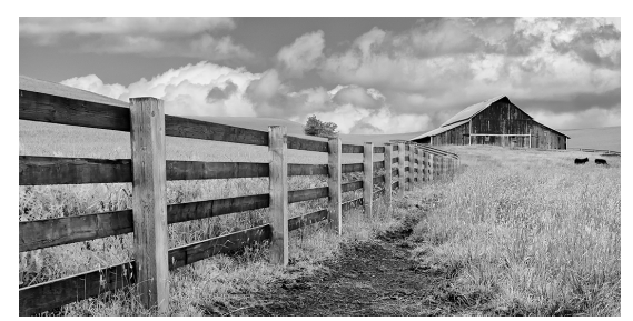
Palouse Farmland Leslie Ege