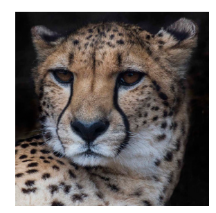
Are You Looking at Me? Stennis Shotts