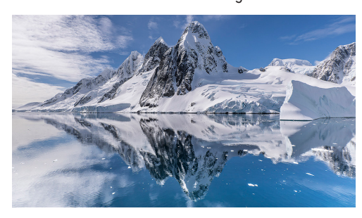
Reflections from Antartica Leslie Ege