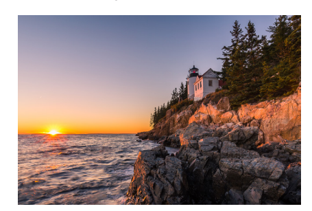
Bass Harbor Head Light