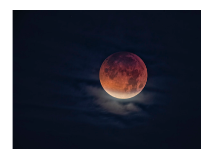
Mysterious Blood Moon Dave Maguire