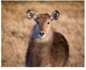
Water Buck Phil Charlton