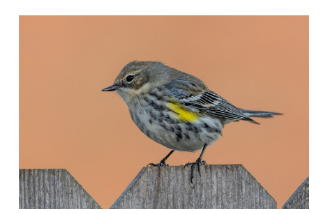
Yellow-Rumped Warbler Dolph McCranie