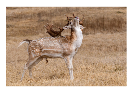
Fallow Deer Beverly McCranie