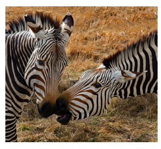
Zebra Chat Beverly Lyle