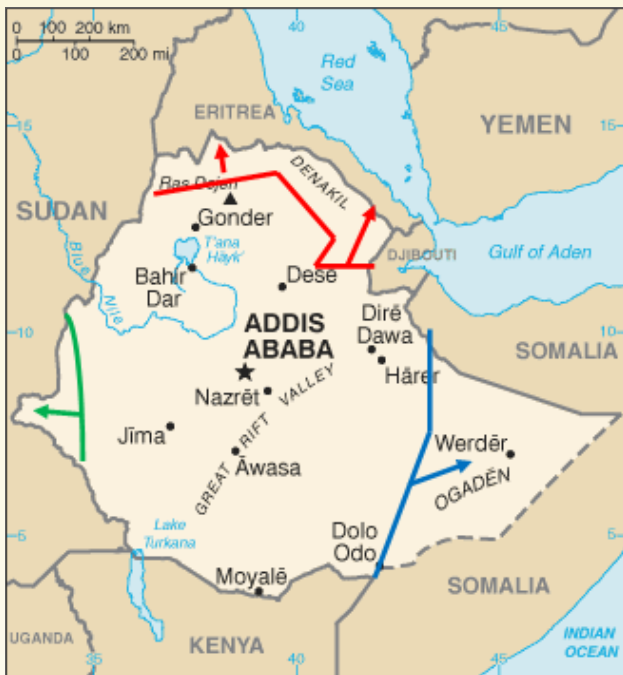
Personal Security, Crime and Terrorism

Throughout Ethiopia: All visitors are strongly advised to review their personal safety and security posture, to remain vigilant, and to be cautious when frequenting prominent public places and landmarks. While Ethiopia is generally stable, domestic insurgent groups, extremists from Somalia, and the heavy military presence along the border with Eritrea pose risks to safety and security.