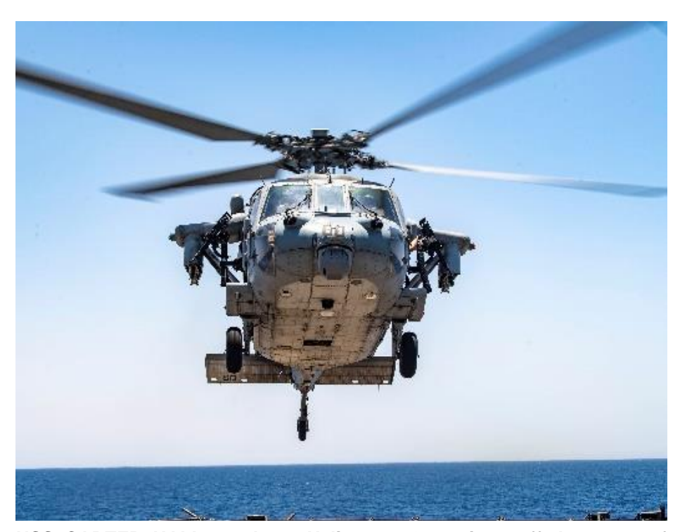
USS CARTER HALL conducts Helicopter Operations off the coast of Jordan.

With our contingent of Marines ashore in Jordan for further training opportunities, the CARTER HALL crew made ready use of the "quieter ship" to train, maintain, and improve our own levels of readiness across many of our seamanship areas: damage control; medical emergency/casualty response; small boat operations; Search & Rescue/Recovery;