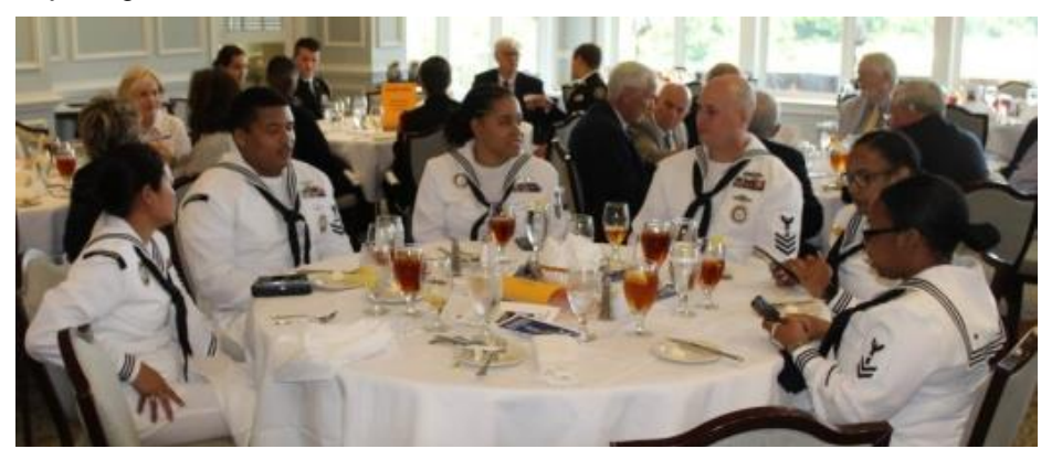
Richmond Navy Talent Acquisition Group (NTAG)