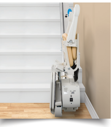
With a foldable footrest, seat and armrests, the 950 boasts a slim profile of only 111/4 inches, ensuring other stair users can still use the staircase comfortably and safely.