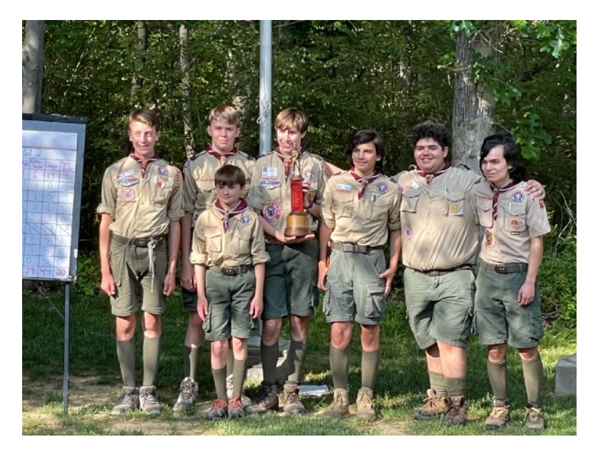
THE WINNERS: COUGAR PATROL!

Part I tests skills like 8-Knot, Scout's Pace, Nature Identification, Judging, Compass, and Water Boiling. First, we did Scout's Pace. The goal of this competition is to run/walk a mile in exactly 12 minutes using the 50-stepswalking-50-steps-running method. The patrol that runs/walks the mile closest to 12 minutes wins. Overall, most of the patrols came in early, with Panther patrol getting first place. The next competition involved using a compass. Most patrols didn't struggle at all with this and Flying Eagle came in first. After this was Nature Identification. Each patrol went around to marked plants and had to determine what species they were. Some patrols did much better than others at this, with Cougar winning first place. Judging is a competition about estimating certain dimensions of objects. In this competition, Rattlesnake came first. Next, the Cougar patrol came first in the 8-Knot contest and got the troop record with a time of 55.92 seconds. The last challenge of the night was Water Boiling. As soon as our SPL said go, each patrol ran into the woods to get twigs and sticks to use to build their fire. All patrols managed to make a fire with Moose patrol getting first place. At the end of the night, the Cougar patrol was tied with the Panther patrol for first place, with Flying Eagle in second and Moose right behind in third.