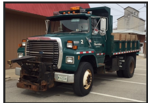
The Village's Ford Dump truck has been sold-$10,500

Sheridan Fire District Trustee Meetings-1st Thursday 7:00PM @ Fire Station