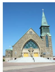
Saint Augustine's 340 Dominion Street Moncton, NB

November 12th 2017 Thirty-Second Sunday in Ordinary Time