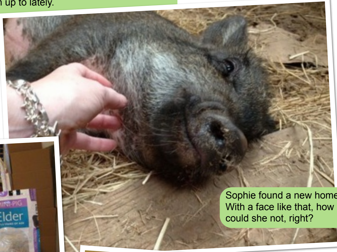
Sophie found a new home. With a face like that, how could she not, right?

Are you on facebook? If so, stop by the CPPA Facebook page and say hello! If you're not, here's a little of what our page has been up to lately.