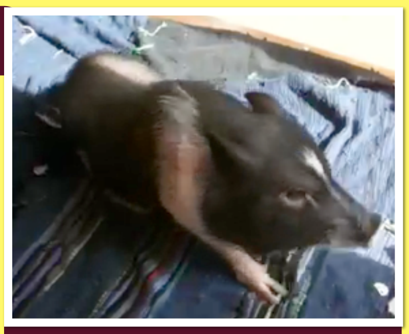
A CPPA member sent us videos (<u>here</u> and <u>here</u>) of a pig showing Dippity Pig symptoms. They slathered her with cortizone and gave her coated aspirin, and 48 scary hours later, she was fine.

Despite its gruesome symptoms, DPS is easy to treat into submission - you can give baby aspirin, children's benadryl, and use cortisone cream. And do what