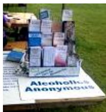
East Side Family Summit

The meeting began with a quick report on our participation at the East Side Family summit where Al-anon graciously allowed us to share their space. Several pamphlets and schedules were distributed at that event and we found being with Al-anon to be a very positive experience.