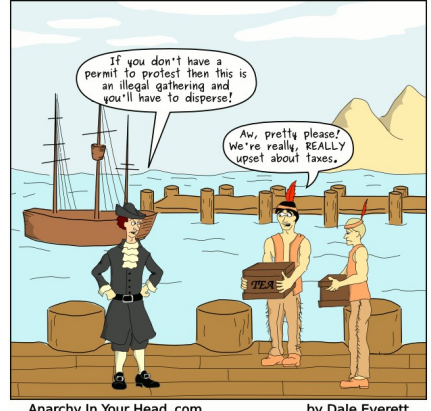
narchy In Your Head .com

"in this way we are reaffirming the transcendence of religious faith in America's heritage and future; in this way we shall constantly strengthen those spiritual weapons which forever will be our country's most powerful resource in peace and war."