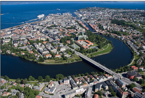
Trondheim and Nidelva

Which U.S. and Canadian cities ranked highest on the list? Coming in at number 33 is Boston, Massachusetts and ranking at number 38 is Vancouver, Canada.