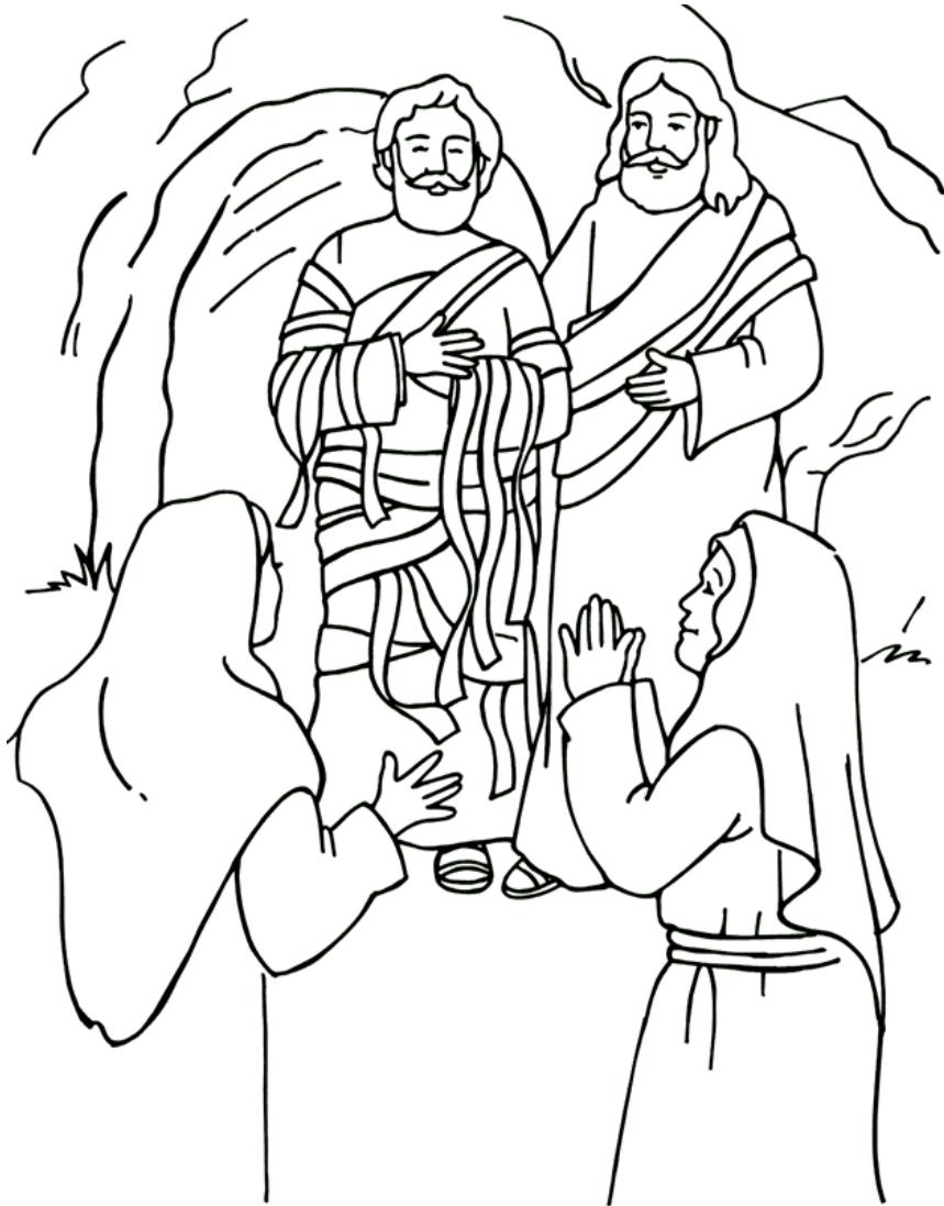
Jesus Raises Lazarus

Image from Thru-the-Bible Coloring Pages for Ages 4-8. © Standard Publishing. Used by permission. Reproducible Coloring Books may be purchased from Standard Publishing, www.standardpub.com , 1-800-543-1301.